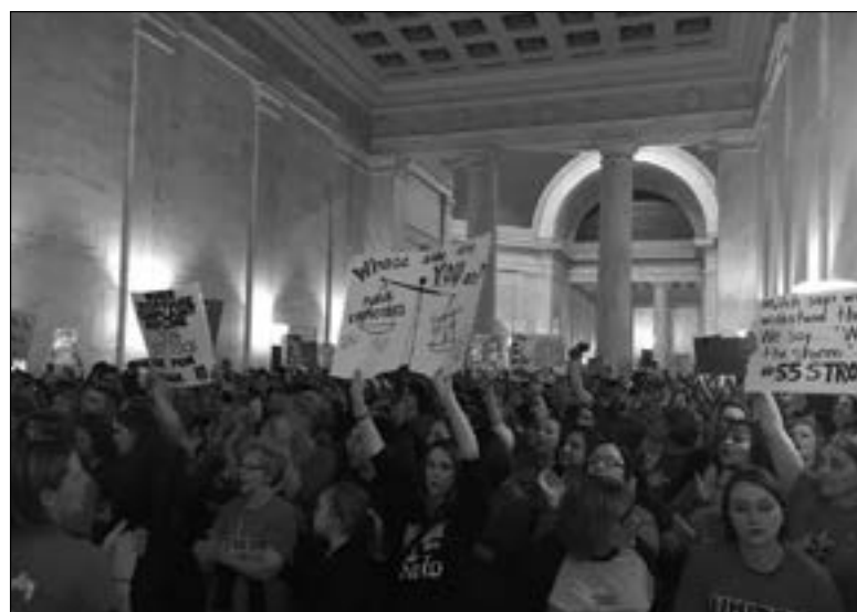
West Virginia teachers strike sparked teacher revolt.

Of course, underlining this increase in union activity has been the savage attacks on living standards and working conditions on the job, particularly directed against young workers, women, and people of color. Further, the spiraling