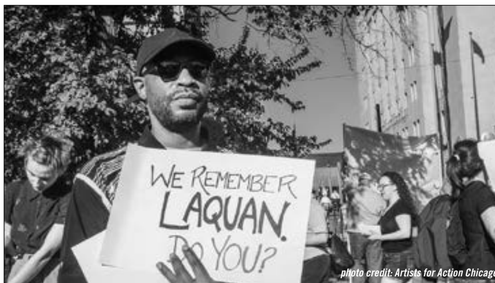
Hundreds of people protested as the trial of Laquan McDonald's killer opened in Chicago.

In the weeks following the release of the video, city streets and Interstates were repeatedly blocked by massive crowds calling on Rahm Emanuel and State's Attorney Anita Alvarez to resign. Emanuel's reputation was irreparably damaged after the video was suppressed for months - with even establishment figures speaking openly of having no confidence in his ability to govern. Rahm has now announced that he will not run for Mayor again.