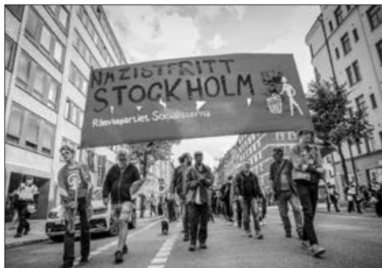
Members of Rättvisepartiet Socialisterna (CWI in Sweden) the banner reads "Nazi-free Stockholm."

On top of this, in 2015 the government reversed its policy on refugees. The Swedish establishment has switched from offering permanent permits for everyone from Syria to attempting to close borders, blocking family reunification, and only offering 3 year maximum