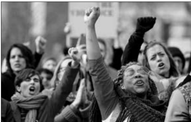
Women's March in St. Louis, Missouri

While legal defense funds will certainly be helpful to survivors, the existing legal framework for taking your employer to court for sexual harassment is completely inadequate. Even when workers win