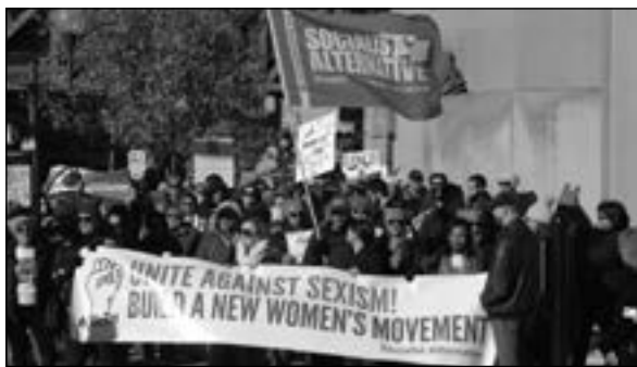
Socialist Alternative at the 2018 Women's March in Columbus, OH.

The primary strategy of capitalism to maintain the rule of a tiny few over billions of workers worldwide is to divide workers from one another along the lines of race, national origin, religion, and gender. Socialist feminism recognizes that the oppression of women is part of the system of capitalism itself, and not simply caused by bad laws, outdated attitudes, or even men themselves. Socialist feminists fight for reforms that make a real difference in the lives of women and to foster solidarity among working-class people. At the same time, we recognize that full liberation for women is only possible on the basis of a socialist transformation of society that eliminates all forms of oppression. ✪