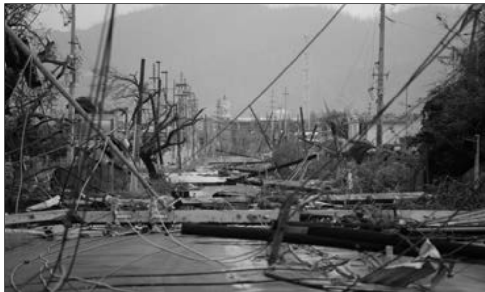
Toppled electricity poles in Puerto Rico following Hurricane Maria

Officials have placed blame for the delayed restoration on the geography of the island itself. While logistical challenges are real, a more honest conclusion can be found by looking at the for-profit “solution.” After handing out $300 million to a private power company from Montana, which only had two employees, the government was forced to cancel the deal and look for other companies. Puerto Rico’s publicly-owned utility company (PREPA) has been suffering from heavy cuts and privatization with its American creditors demanding that it raise electricity rates which are already double the U.S. average. The reliance on private companies has meant that the island is opening itself, in its most dire