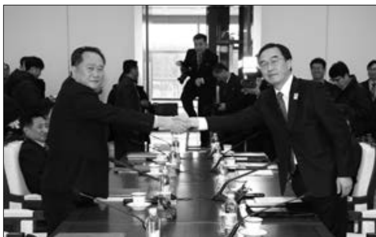
North Korea and South Korea agreed to a combined Olympics delegation.

With its "America First" strategy, Trump's administration is playing a dangerous game. With the rise of China, U.S. imperialism's position globally and especially in the Far East is diminished. Despite still being the strongest power on the planet, the hopes of the billionaire class for a unilateral U.S. domination after the fall of the Soviet Union never materialized. The Trump administration in a clumsy, erratic and aggressive way has tried to restore U.S. imperialist ambitions with brute force where soft power – diplomacy based on