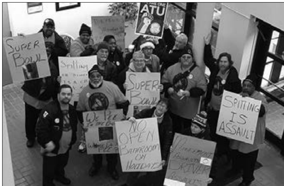
December 11, 2017 - ATU 1005 members in a small action in the MetCouncil offices.

Earlier in the year, union activists, including Socialist Alternative members, began to