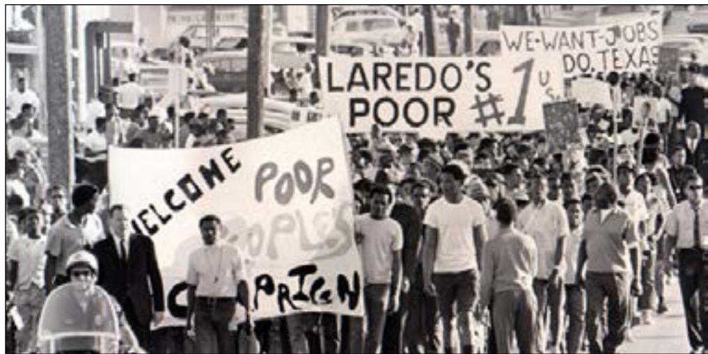
A poor people's march in Laredo, Texas.

It is hard to say at this point whether the new Poor People's Campaign will truly take off, but its organizers are pointing in the right direction – toward the need for a new multiracial movement of working people, the poor, and the most oppressed. Bernie Sanders' campaign in 2016 also raised the need for a massive redirection of society's resources to end poverty. But we will need to go further and create a new political party based on the interests of working people and the poor which can challenge the entire capitalist establishment, which is complicit in creating the conditions we see today. As Dr. King powerfully exclaimed, "Oppressed people cannot remain oppressed forever." ☘