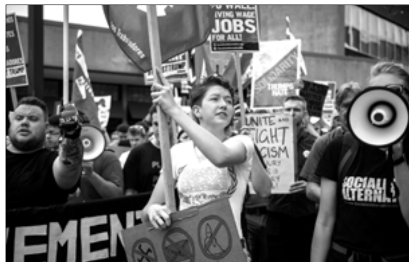
40,000 people rallied in Boston against the alt right.

To effectively combat the “alt right” it will take the largest possible mobilization of students, people of color, women, LGBTQ people, and working people generally to outnumber their forces 1,000 to 1 as demonstrated in Boston in August. This approach is often complicated by those committed to “black bloc” tactics based on individual acts of protest which have produced acts of vandalism as we saw earlier in the year at anti-Milo protests in