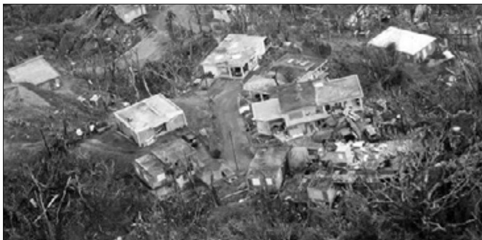
Devastation in Puerto Rico after Hurricane Maria.

support workers in their transition into clean energy jobs. (bernieanders.com/issues/climate change)