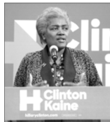
Donna Brazile's book has revealed the collusion between Hillary and the DNC.

Many genuine activists still believe that the Democratic Party can be reformed. Unfortunately, the corrosive culture, ideas, and dominance of corporate politics