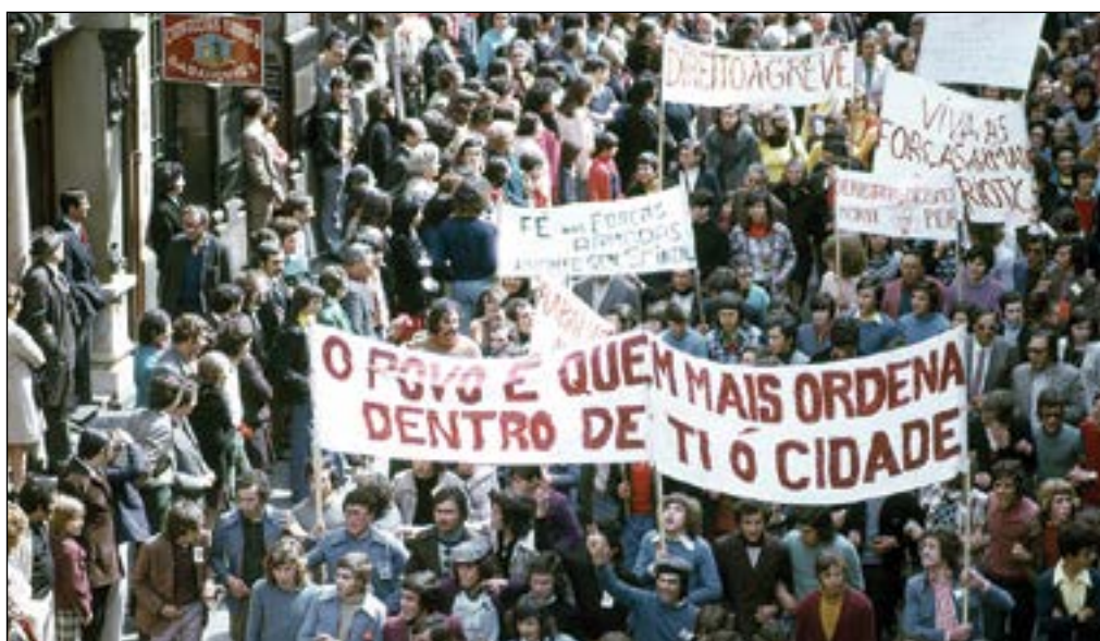
Portugal in 1974 was just one of the many times the working class posed the question of taking power in the 20th century.

The masses made their agreement with Lenin and Trotsky clear. A workman, "his face convulsed with rage, said: 'I speak for the Petrograd proletariat... We are in favour of insurrection. Have it your own way, but I tell you now that if you allow the soviets to be destroyed, we're through with you.' Some soldiers joined in