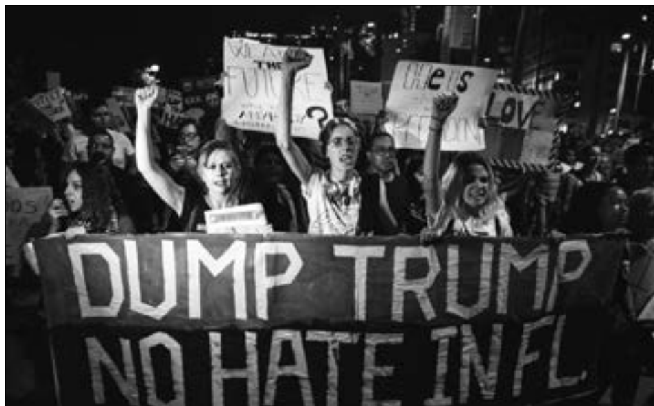
Demonstration against Trump in Miami, FL.

Trump's regime is unpredictable and deeply reactionary. In just a few months, he's threatened disastrous war against