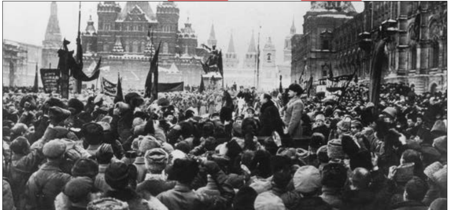
Speeches in St. Petersburg in October 1917.

Millions of Americans were inspired by Bernie Sanders' presidential campaign last year and his demands for far reaching change in the interests of working people. The already resurgent interest in left ideas was catapulted into an even broader discussion of "democratic socialism" and rapid growth of socialist organizations like Socialist Alternative and the Democratic Socialists of America.