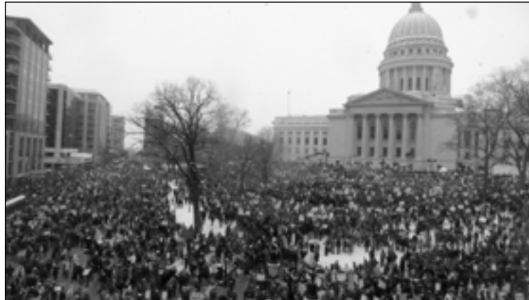
Labor protesters at the Wisconsin capitol in 2011.

The Janus ruling by the Supreme Court is likely to happen in June, long before fall elections. There is no guarantee that Democrats, if elected, will pay any attention to reversing Janus-based RTW laws. The example of the 2011 labor movement in Wisconsin should be a warning. While a mass movement could have developed into a general strike, the union leaders instead focused on a recall election in