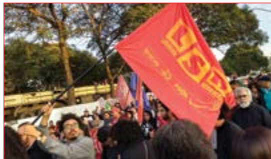
The LSR is the Brazilian section of the Committee for a Workers International.

Unfortunately, the revolutionary wave was defeated, leaving the Soviet Union isolated. This defeat played a key role in the emergence of the conservative, parasitic Stalinist bureaucracy. This bureaucracy spread its control throughout the Comintern. It lost its role as a mass revolutionary international and was converted into an instrument of the Kremlin's foreign policy which prioritized the interests of the bureaucracy over workers' struggles. The Comintern supported Chiang Kai-Shek in China in the late 1920s even as he had Chinese communists massacred; it stood by as Hitler came to power in Germany; and it actively sabotaged the Spanish revolution in the late