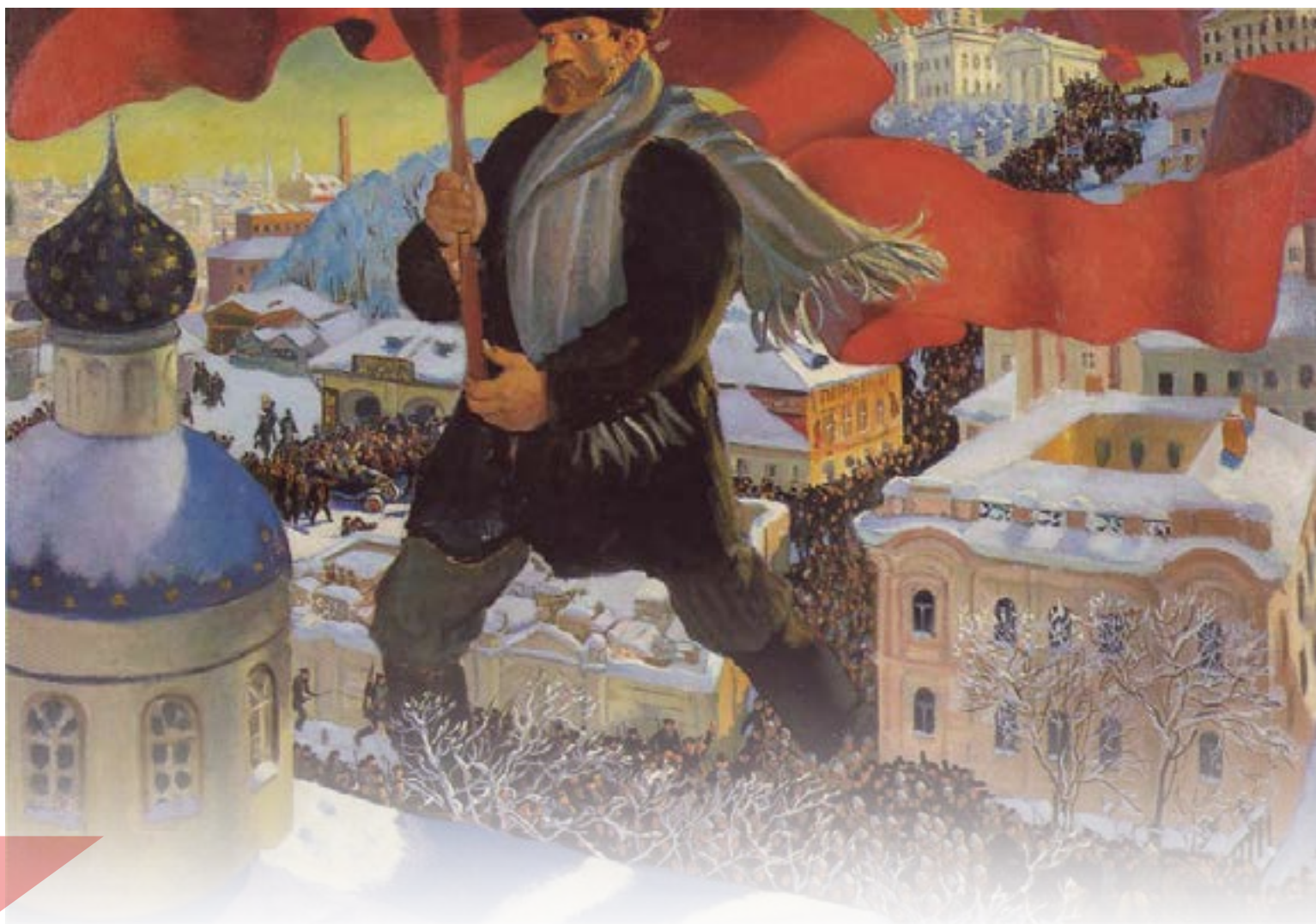
The Bolshevik, 1920 by Boris Mikailovich Kustodiev.

In the midst of the upheavals in Russia, Trotsky took time out to discuss with John Reed about the international implications of the Russian revolution: “At the end of this war I see Europe recreated, not by the diplomats but by the proletariat. The Federated Republic of