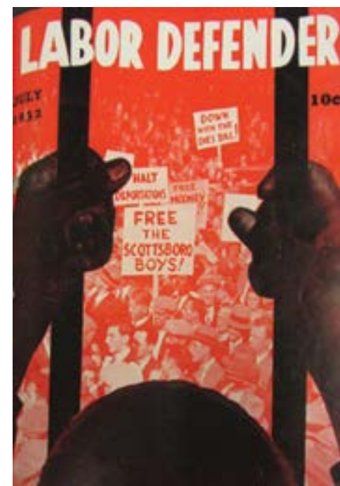
In the 1930s, the Communist Party played a leading role in the fight against racism including defeding the Scottsboro Boys.

The CP played a major role in the development of the industrial unions in the Congress of Industrial Organizations (CIO) and the strike waves of the late '30s. They also played a leading role in the fight against racism and Jim Crow, helping to lay the basis for the civil rights movement. But by the 30s Stalinism had led to degeneration of Soviet Union and the Comintern and this also had a profoundly negative effect on the politics of the American CP. In the name of the false policy of the "popular front" with "progressive" capitalists, the CP played a key role in preventing the development of a broader workers party and propping up the Democratic Party in this period of profound radicalization. This lost opportunity had a profoundly negative effect on the subsequent development of the U.S.