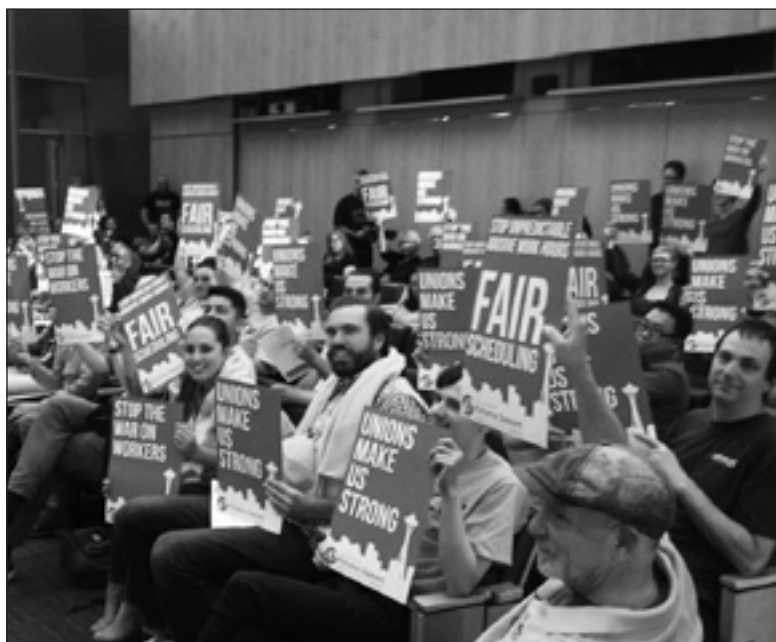
Seattle Town Hall with REI workers focused on Fair Scheduling - July 11, 2016.

Recently, a small group of REI workers began organizing REI Employees for Real Change,