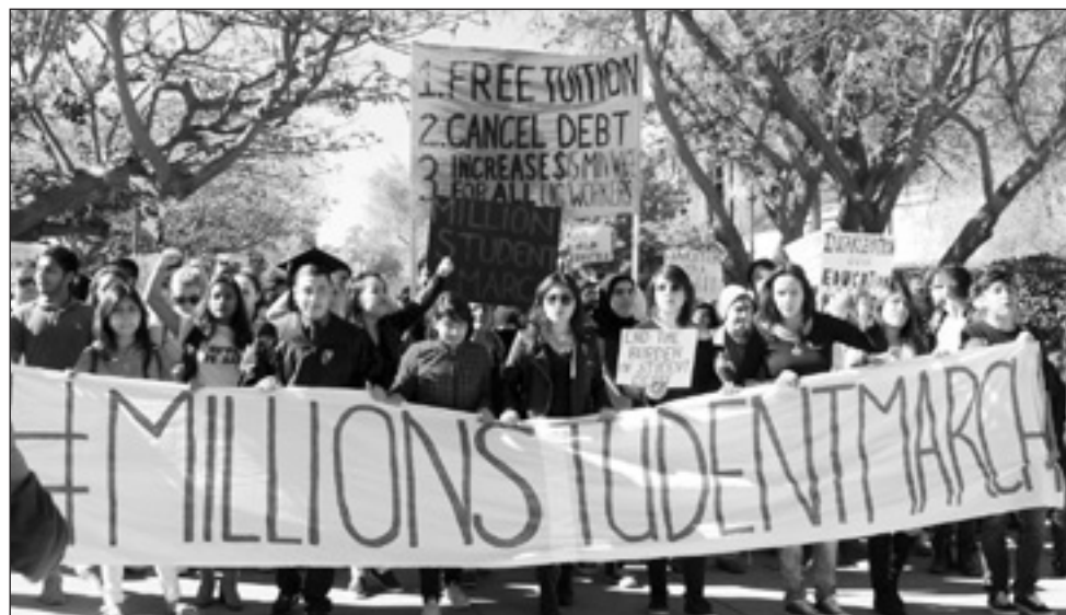
Million Student March day of action, November 2015.

From campaigns for fossil fuel divestment, to campaigns against sexual assault on campus, to the #MillionStudentMarch for