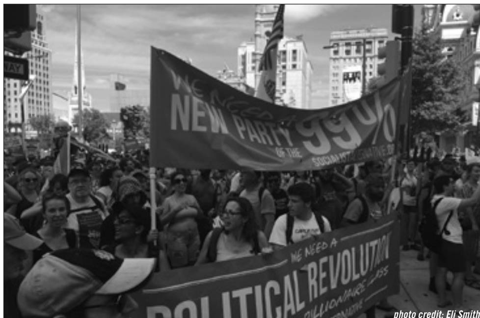
Socialist Alternative on the streets of Philadelphia during the DNC.

The liberal media have focused on Trump's white working-class supporters as motivated centrally by "racial insecurity" caused in part by the country's changing demographics. It is undoubtedly true that xenophobia is a key part of Trump's appeal for a section of the Republican base. But the frequently crude attempts to dismiss the white working-class as one reactionary mass are fundamentally