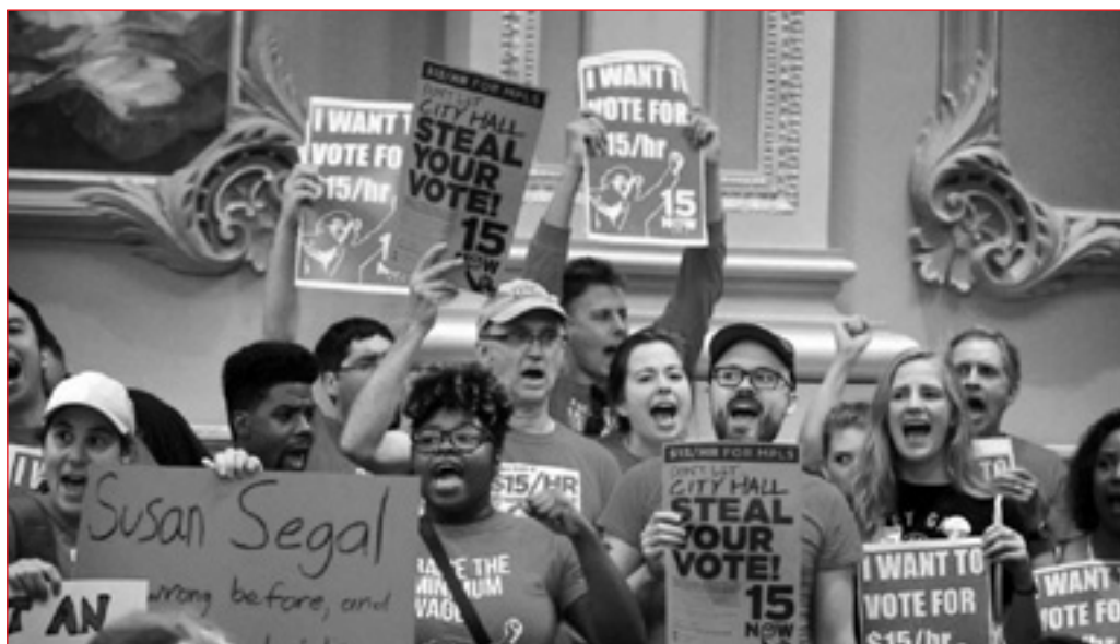
15 Now protesters occupy Minneapolis City Council Chamber, August 3, 2016.

The Democratic Party led Council made politically motivated arguments to avoid the question of $15. Council members hid behind small business, and in one case, a council member compared $15/hr to the "Brexit" referendum to illustrate that ordinary workers can't be trusted to make important decisions on the economy. It exposed how the Democratic Party gives lip service to progressive causes, but in the end defends the interests of big business. Like with Bernie Sanders' campaign, the Democratic Party worked overtime to block $15/hour. It shows we need to build a party that is