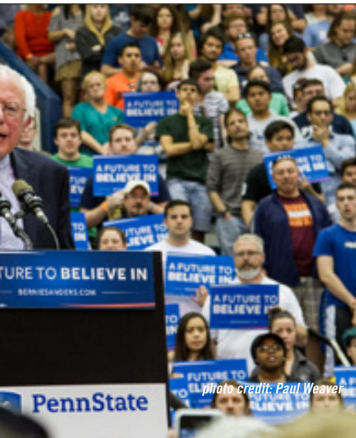
Bernie speaks to a massive rally at Penn State.

From the floor, Socialist Alternative speakers raised the idea of calling a national conference to discuss how to keep Labor For Bernie together after 2016: such a conference could be a step to a new party of the 99% run by, and for, working people, with the vital leadership of organized labor. Concretely, unions should look to run independent candidates in local areas to build on Bernie's success. ☺