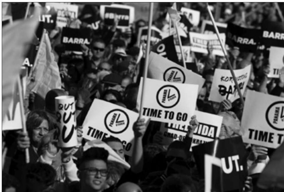
Demonstrations in Malta call for the resignation of the prime minister.

Gabriel Zucman, a professor at the University of California, Berkeley, and the author of The Hidden Wealth of Nations , said in an interview with National Public Radio that the Panamanian law firm represents a fraction of the total in riches obscured from public scrutiny, calculating that about eight percent of the world's financial wealth is held in tax havens, or about $7.6 trillion. Oxfam has also