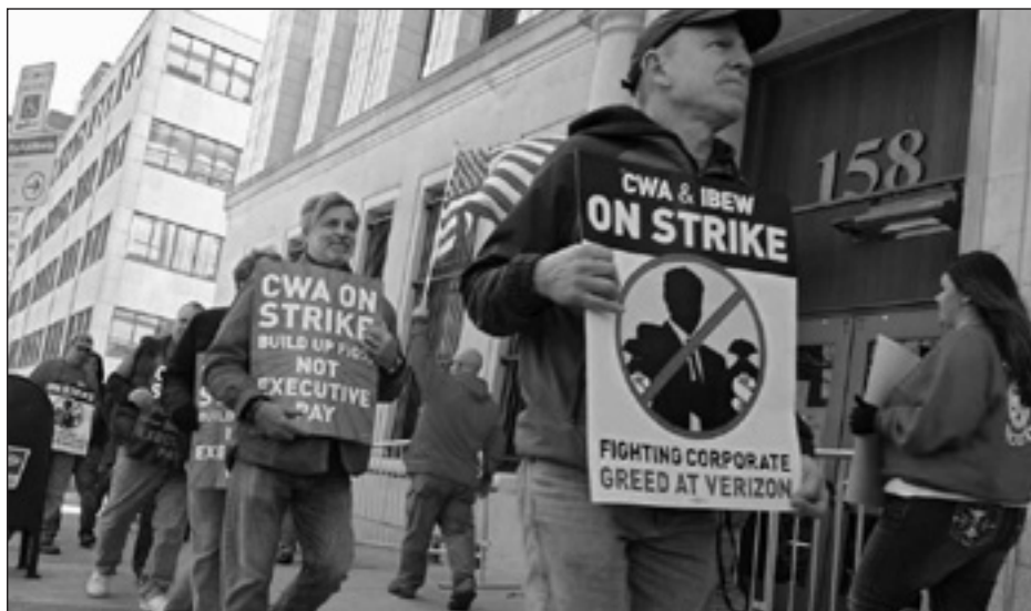
Verizon workers walk the picket line.