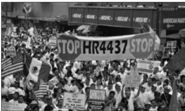
Over one million took to the streets on May 1, 2006 “Day without an immigrant.”

Facing growing anger from the immigrant community, and with the Democrats once again looking to build an electoral majority in 2016, Obama signed an executive order last year lifting the threat of deportation for several millions. While this was a step forward, its legality was challenged by the right, and the order was blocked by a court in Texas. This has been appealed to the U.S. Supreme Court, where a probable deadlock will result in the decision