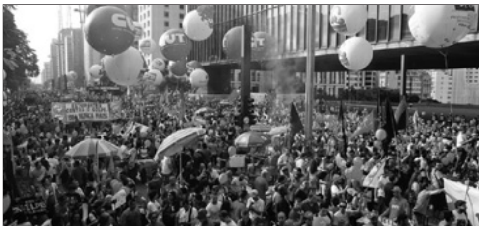
International corporate media downplayed or ignored massive pro-Dilma rallies in Brazil.

These events came just a few days before a planned "day of action" organized by right-wing groups calling for impeachment against Dilma on Sunday, March 13. The composition of the demonstrations was mainly middle-class: white people with high wages, university degrees, and a high average age. The