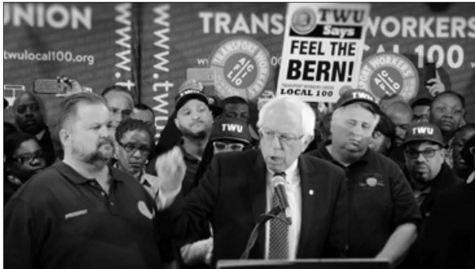
Transport Workers Union Local 100 in New York City endorsed Bernie Sanders.

Around the world, where workers have won far-reaching reforms like single-payer health care, free education, or paid parental leave, it's been through forming mass workers' parties. In Canada, trade unions launched the New Democratic Party with socialized medicine as their central demand. They won less than 15% of the national vote