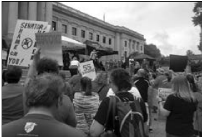
Demonstration at WV Capitol in Charleston, June 2019

Before the West Virginia strike in 2018, the historic 2012 Chicago Teachers Union (CTU) strike inspired teachers across the country. Both the CTU, and SEIU local 73 (which represents support staff, security officers, and custodians in the public schools) are once again in negotiations with the Chicago Public School District for a fair contract that includes enforceable class size limits, no non-mandatory testing, and a moratorium on charter schools. Activists report the strong possibility of coordinated strike action in Chicago this fall.