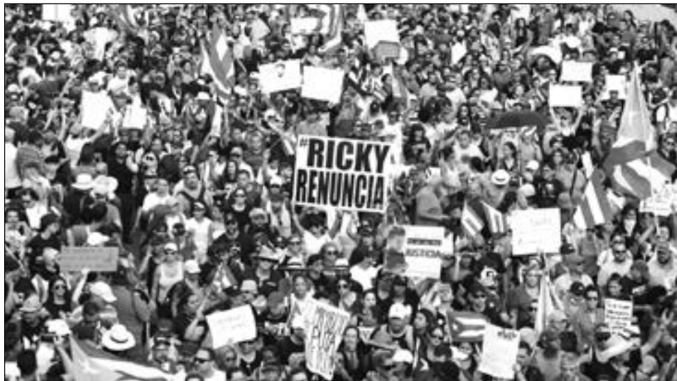
Demonstrations in San Juan calling for Governor “Ricky” Rossello’s resignation.

The leaked text messages between Rosello and other officials that sparked the protests showed with shocking callousness the true nature of the elite. In hundreds of incriminating messages they joked about murdering the mayor of San Juan and made