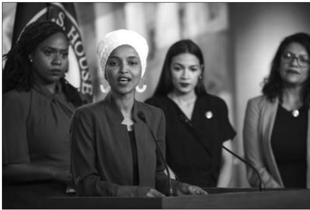
Representatives Ayanna Pressley, Ilhan Omar, Alexandria Ocasio-Cortez, and Rashida Tlaib at a press conference.

But we have to be clear that the pressure of “public opinion” by itself will not force the Democrats to change their nature as a party