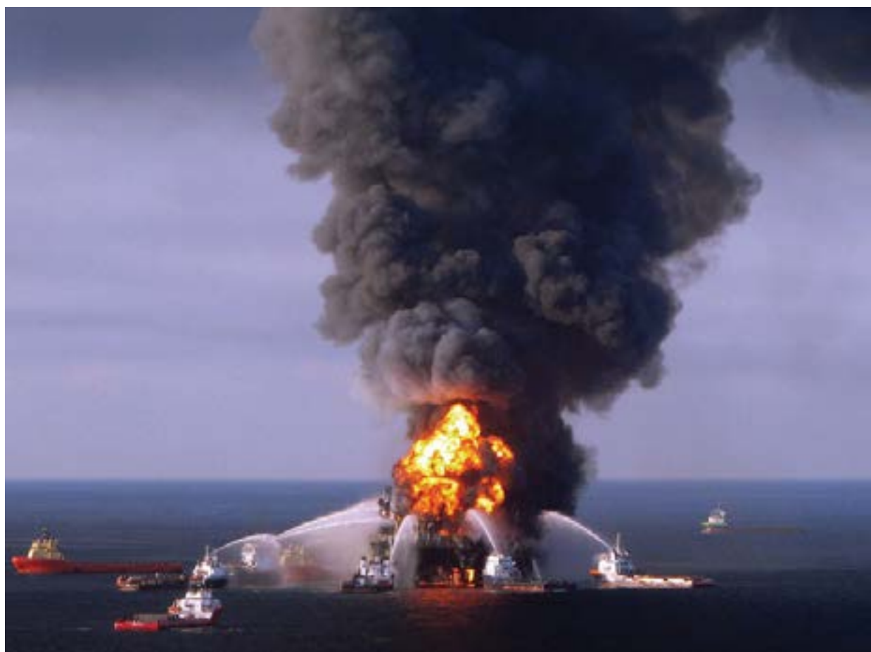
The Deepwater Horizon oil spill in 2010 killed 11 workers, injured many more, and emptied 4.9 million barrels of oil into the Gulf of Mexico.

Historically, capitalism unleashed human productivity on a massive scale. However, the defining features of capitalism – private ownership and the nation state – have now become a fetter to the further development of our