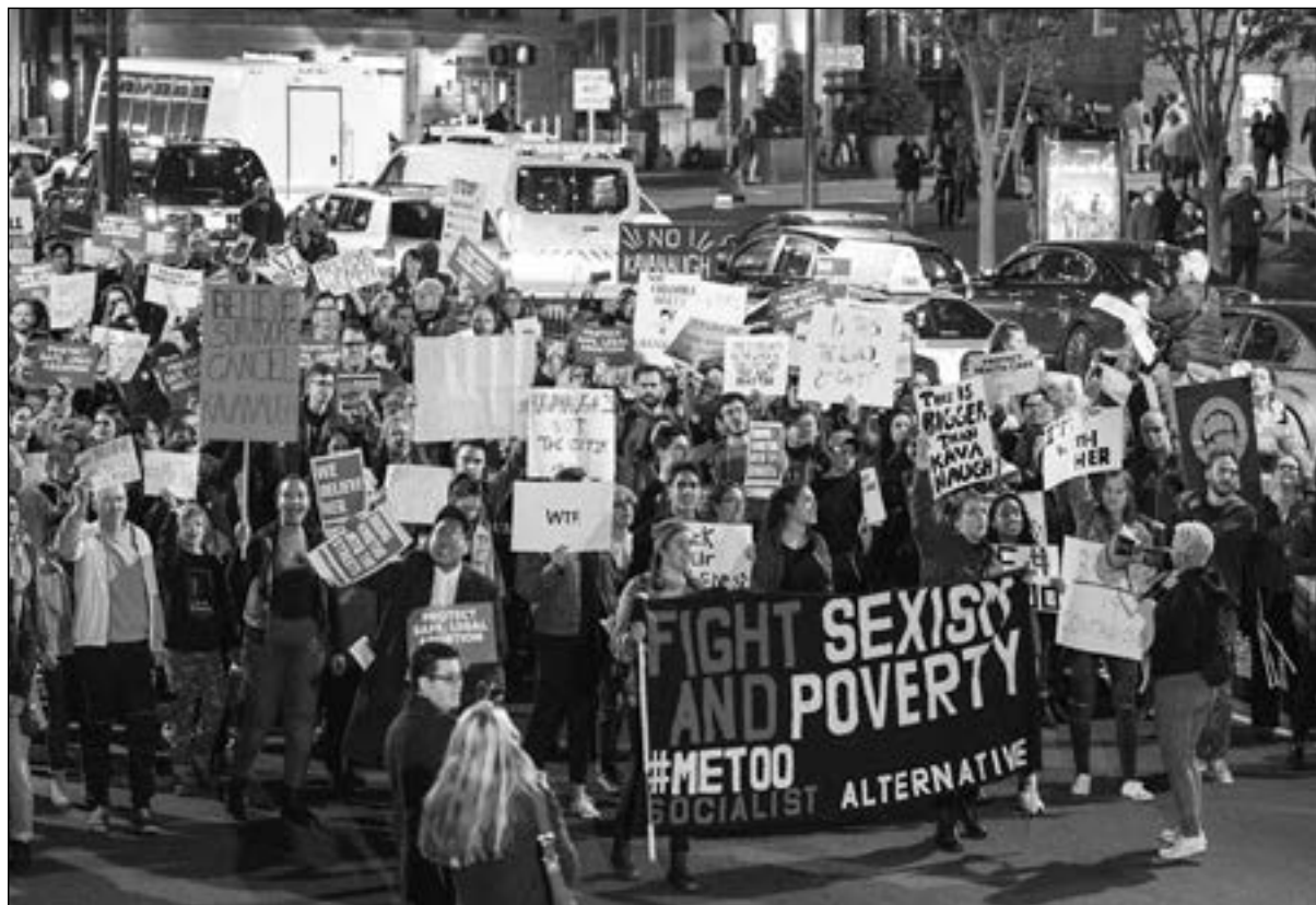
A march lead by Socialist Alternative in October of 2018 against the appointment of Kavanaugh to the Supreme Court

If you agree with what Socialist Alternative stands for – join us! ☘