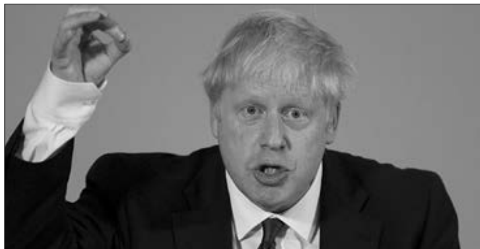
Boris Johnson Britain's new Prime Minister

This should include campaigning around a clear, socialist program of nationalization, an end to austerity and measures to eliminate poverty through investment in socially