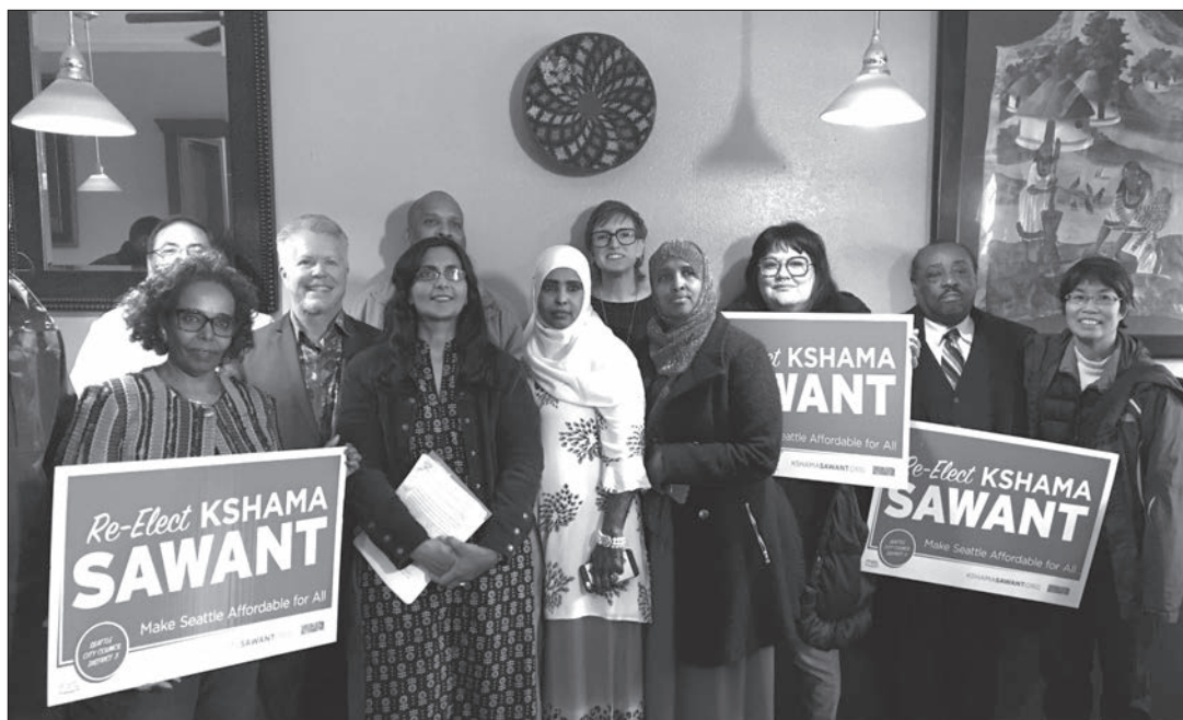
Kshama Sawant's reelection launch announcement.

We need to build tens of thousands of units