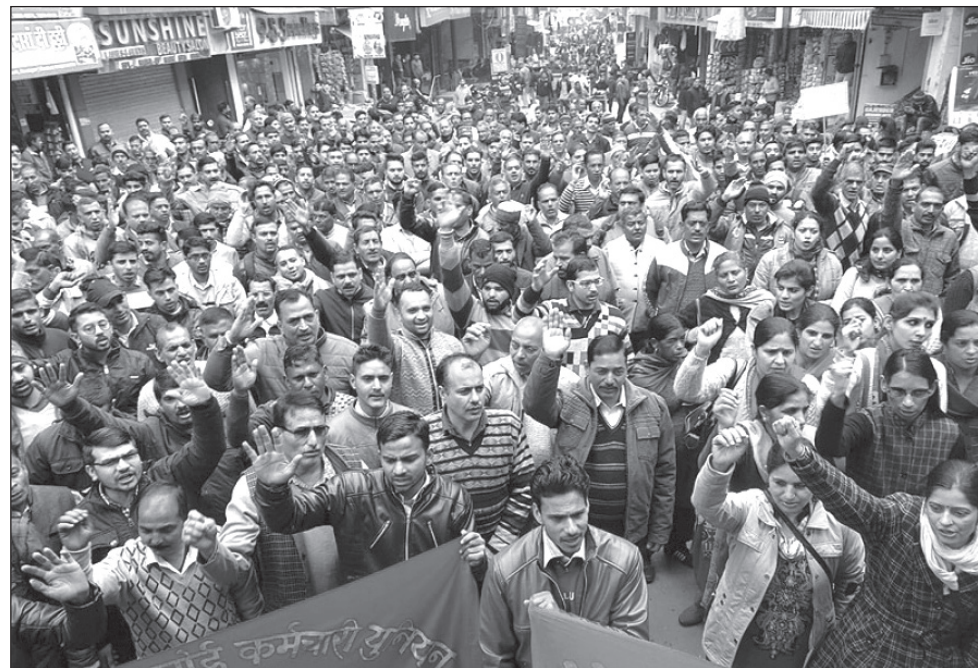
Bengaluru rally during India's general strike against Modi government's policies.

The January strike was extremely important for the trade union movement, but the timing also reveals some of the weaknesses of the trade union leadership. As our sister organization in India, New Socialist Alternative, has pointed out, the ten to twelve-week period after demonetisation was a critical moment for organizing what could have been an earth-shattering general strike due to the