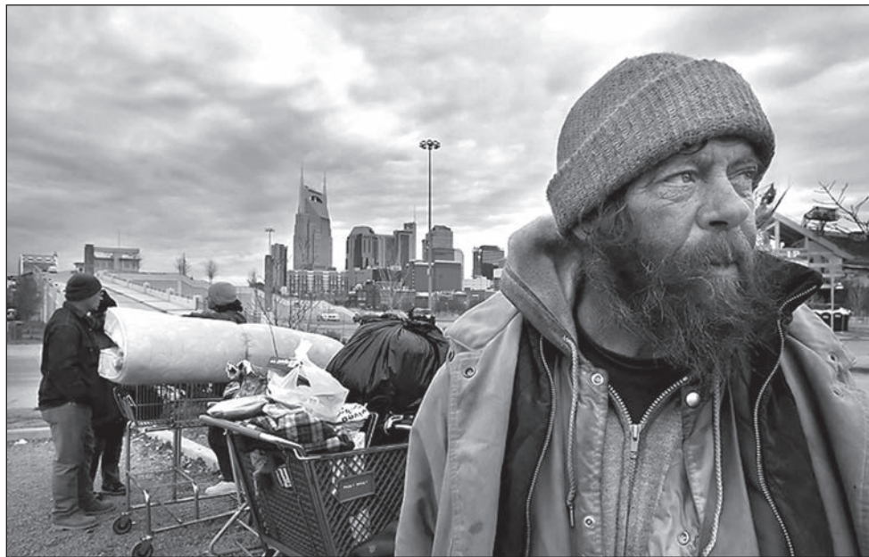
Poverty and homelessness are growing in capitalist America.

inequality "goes beyond dollars to the 'deaths of despair' caused by the stresses of inferior health care coverage, stagnating incomes, and out-of-control inequality."