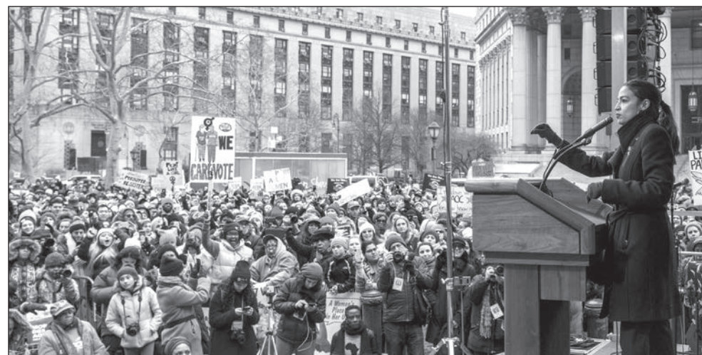
Alexandria Ocasio-Cortez speaks at the Women's March in New York in January 2019.

some mistakes. Most importantly, she voted for Pelosi as House Speaker. In the end, this got AOC nothing – the special committee she hoped to get for a Green New Deal was ultimately killed by Pelosi.