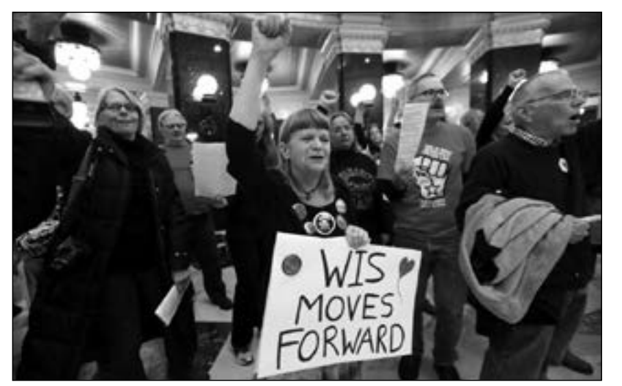
Hated Wisconsin Governor Scott Walker lost his relection bid in 2018.

But is it fascism or "incipient fascism"? Fascism historically was embodied in mass movements made up particularly of middle-class people left destitute by the crisis of capitalism. It aimed at physically smashing the organizations of the working class and the left. Fascists came to power when sections of the ruling class saw them as a preferable alternative to the real threat of social revolution that would lead to them losing their property and power. The context today in the U.S. is obviously quite different. However, there is a profound social crisis and loss of