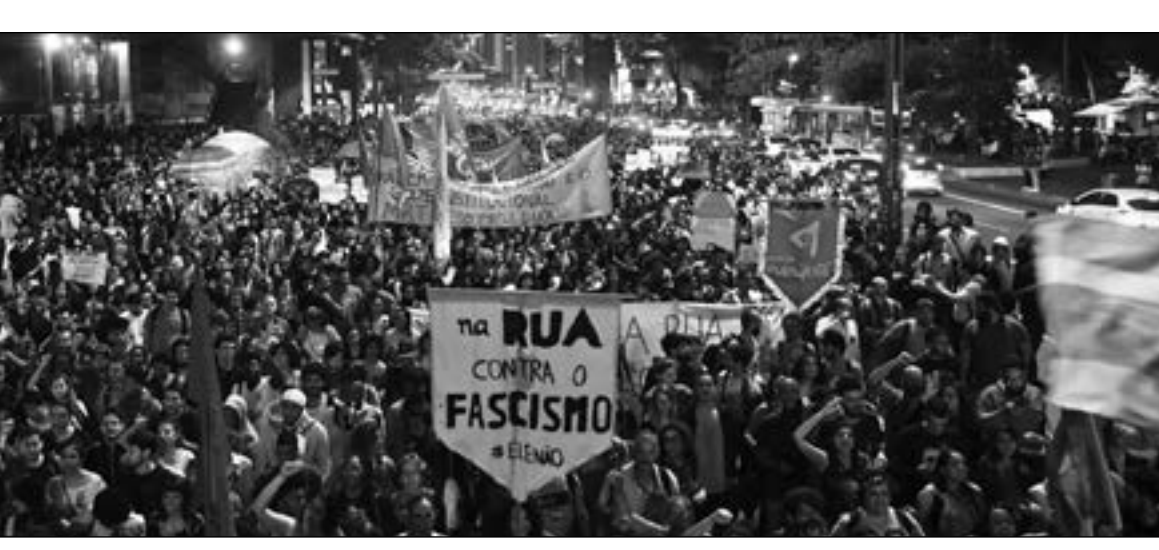
Protests quickly broke out against Bolsonaro following his election. The main sign reads: "On the street against fascism."

Bolsonaro was elected on the basis of a sequence of coups and abuses following the institutional coup that brought down Dilma Rousseff, the former President from the Workers' Party (PT). [The PT was in power from the early 2000s until now, and while they were initially put into power with a large mandate and instituted some