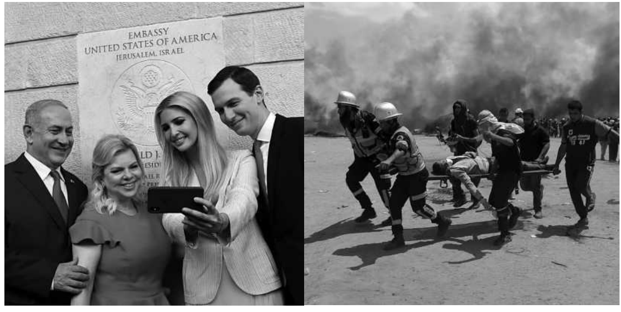
Ivanka, Jared Kushner, and Netenyahu celebrate while Israeli forces shoot Palestinians.

Trump's threat to re-impose sanctions on Iran and on companies that do business in Iran is clearly aimed at forcing "regime change" in Iran. But in the short term it will probably rally support behind the