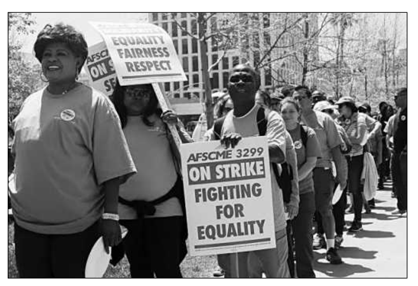
The University of California's largest employee union is holding a three-day strike.

UAW Local 2865, representing UC graduate student instructors, will be out of contract at the end of June, adding the potential to shut down the classrooms. Workers' strength is in our numbers and in our solidarity. It's critical to maintain and grow the union coalition that was established with this strike, at both the leadership level, and in the workplace. Union actions up to and including strikes will be much more effective if service employees, nurses, other patient care workers, instructors, researchers, and others