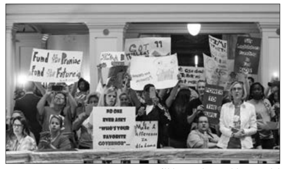
Oklahoma teachers crowd the state capitol.

Free food was delivered daily by local businesses, just one expression of the massive community