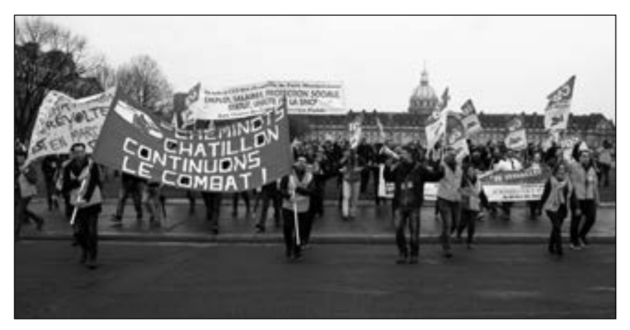
French rail workers are striking two days out of every five.

The solidarity between the railway workers, other workers facing attacks by Macron's neoliberalism, and students is impressive. On March 22, the first day of the rail strike, about 55,000 people marched together in Paris against Macron's vicious attacks. Macron's Sélection law would drastically reduce access to free, quality education to working-class students