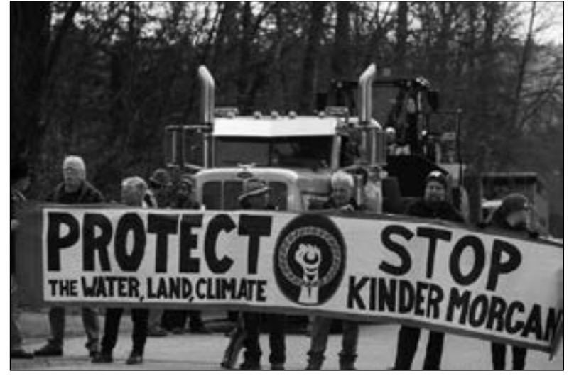
Protest in British Columbia against the Kinder Morgan Pipeline.

The inevitable leak or spill will destroy thousands of jobs in BC. The approval of two other tar sands pipelines and the high cost of processing bitumen with low oil prices have