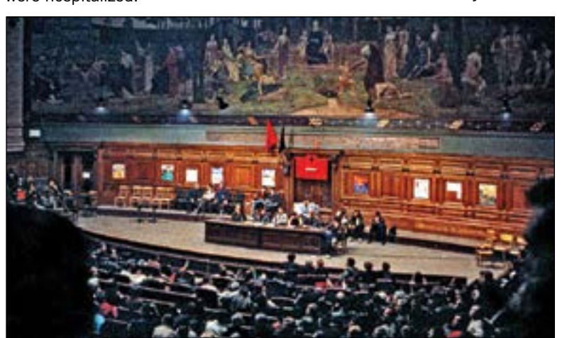
Students held continual assemblies during the month of general strike.

Students were beginning to express their own dissatisfactions – about over-crowded lecture halls, outmoded rules and regulations the war in Vietnam and apartheid in South Africa. Their protests – those inside the universities, with sit-ins and round-the-clock debates and those outside on the streets – were brutally attacked by the forces of the state, including the hated semi-militarized CRS. University campuses were closed. Some student leaders were taken to court and imprisoned. Hundreds were arrested, thousands were beaten and bloodied on the demonstrations, hundreds were hospitalized.