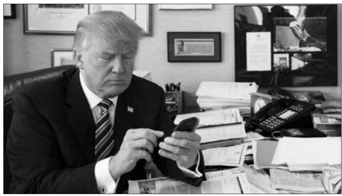
After cabinet purge, Trump is under even less constraints than before.