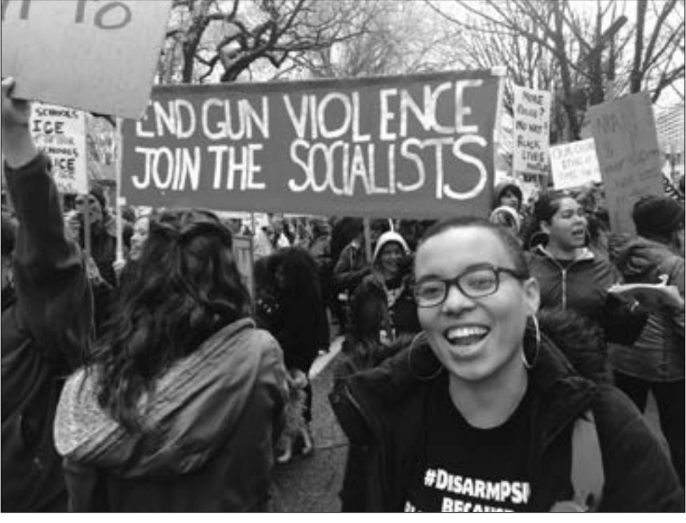
Portland Socialist Alternative at the March 24 March for Our Lives.

On the other hand, a number of black students at Parkland came out publicly to say that an increased police presence on their campus after the massacre had left them feeling more in danger given the epidemic of police shootings of young black men and women. One student said, "It's bad enough we have to return with clear backpacks, should we also return with our hands up?"