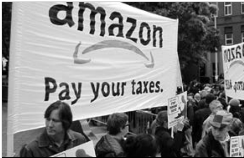
Protest in Seattle.

As described in a Newsweek article, "Amazon: How the World's Largest Retailer Keeps Tax