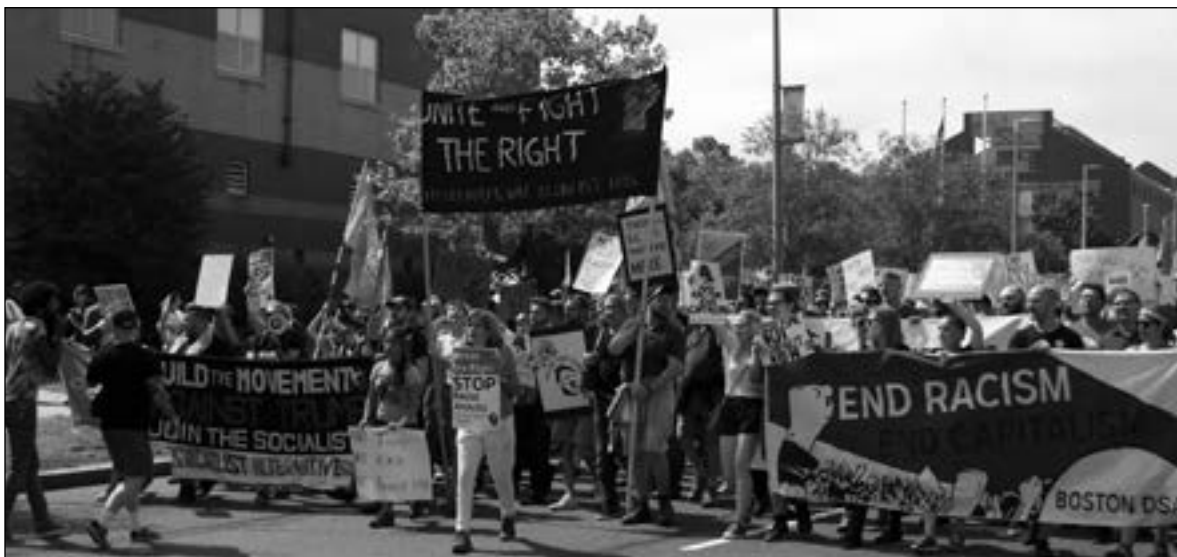
DSA, Socialist Alternative, and other socialists organized a contingent in Boston against the far right in August, 2017.

This approach is attractive to many activists. If your goal is to