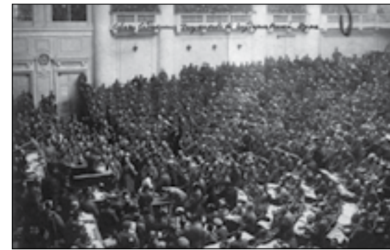
The Petrograd Soviet meeting in August 1917.

When workers in factories formed committees and sent deputies to the local and citywide councils called soviets in Russian, they were also reorganizing production and distribution. By discussing and deciding priorities democratically in the workplace committees and soviets, Russian society was arranged for the needs of the Russian working people, instead of their previous focus - the imperialist war and the profits of the big banks.