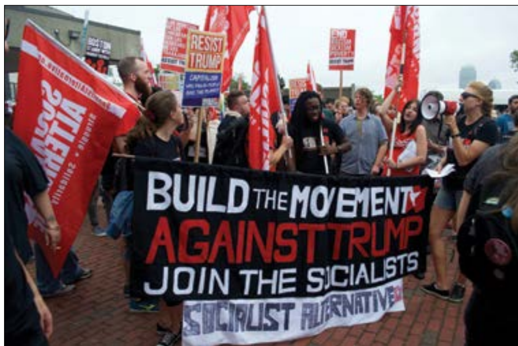
The Socialist Alternative contingent in the anti-alt-right protest in Boston.

Things have reached the point where, "Republicans fear that Mr. Trump has relinquished his role as leader of the party, instead