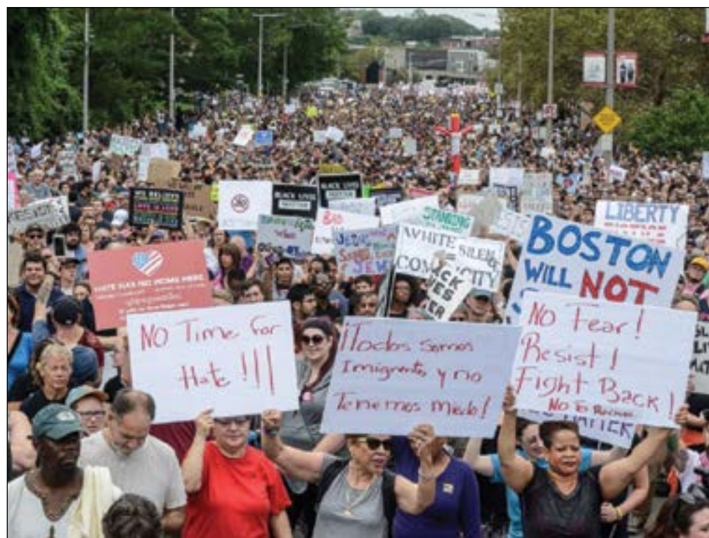
40,000 people march in Boston against the alt-right in August.

But from the point of view of galvanizing opposition, Trump's decision to rescind Obama's DACA program with a six month stay until March 6, 2018 is by far the most important development. This threatens 800,000 Dreamers with deportation but also with loss of jobs, health care, and the ability to attend college. Trump and Democratic leaders Nancy Pelosi and Chuck Schumer say they have a deal to regularize the position of Dreamers in