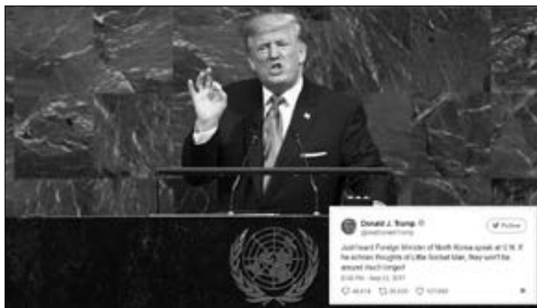
Trump speaking at the UN.

regimes and the continued military threat gave the Stalinist regime room to justify its rule. The U.S., with "operational control" of the Korean army, stood by as two right wing military coups took place in South Korea, in 1961 and 1980.