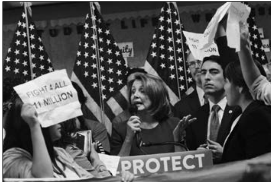
On September 8, immigrant rights activists successfully interrupted Nancy Pelosi’s press conference in San Francisco and shouted “All of us or none of us,” demanding that all 11 million undocumented people in the U.S. be protected.

Trump’s attack on DACA follows his defense of white supremacists in Charlottesville and his pardoning of Joe Arpaio, the notorious Arizona sheriff convicted of illegally racially profiling, humiliating and torturing immigrant detainees. But facing increasing political isolation in Washington and blowback from important sections of the ruling class, Trump is clearly worried that he may have gone too far with DACA. This may partially explain why