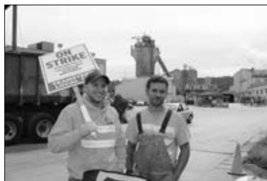
Two Socialist Alternative members at the cement drivers' picket lines.

After a week of picketing, the Teamsters held another meeting to discuss expanding the strike to the other companies and bringing the money-making bonanza of the developers to a screeching halt. The employers caved overnight and a contract was voted in by the members that addresses wage increases, health care, pension contributions, and ending the union busting maneuvers employed by the companies.