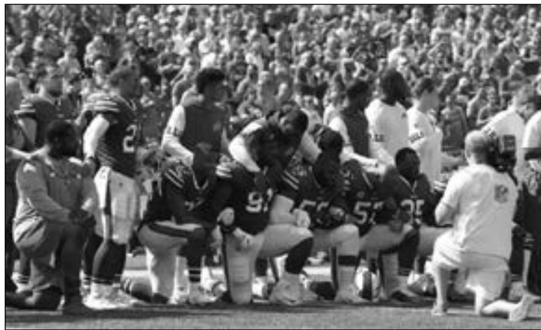
The Buffalo Bills take a knee during the national anthem on September 24, 2017.

"This is choose your side Sunday. It really is. And which side are you on?" - Hall of Famer Charles Woodson.