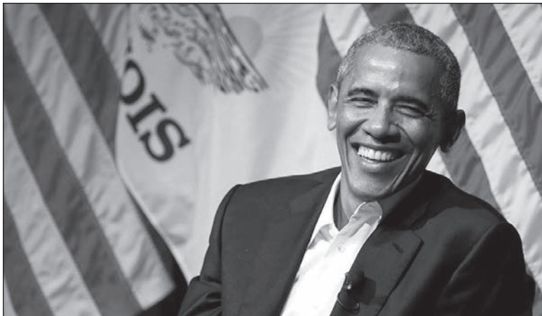
Obama was paid $400,000 apiece for two speeches to Wall Street in April 2017.

So, if the role of Wall Street was a deal breaker for people on the fence about Clinton, why does Obama get a pass? Recently, the liberal media has been doing backflips to defend Obama’s speeches.