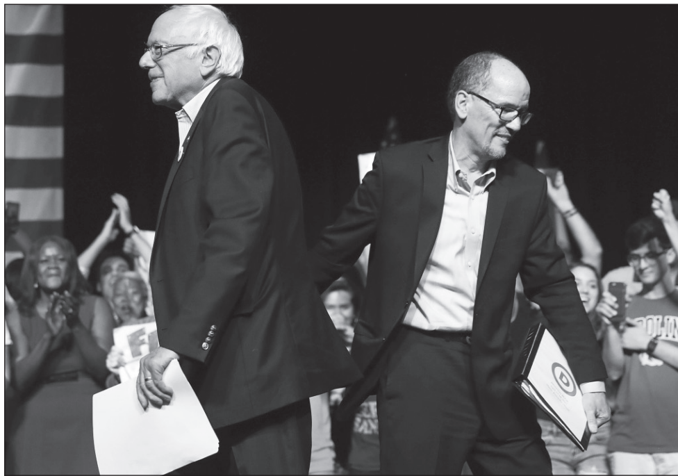
Sanders' and Perez's "unity tour" served to expose divisions between the two.

In sharp contrast, Democratic Party leaders since the election have continued to push back hard against demands for progressive policies—with the party standing firm against