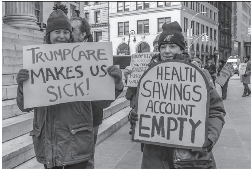
Trumpcare has re-ignited talk of Medicare for All, or single payer, around the country.

Democrats in the House and Senate have correctly attacked Trumpcare, and they clearly view health care as an effective political wedge against the Republicans in the 2018 midterms.