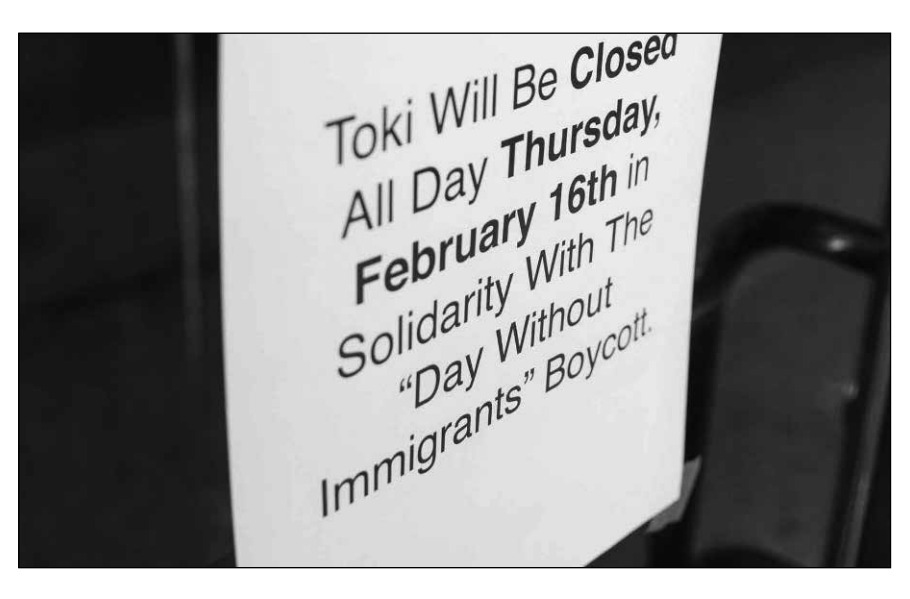
Many businesses closed down for the "Day Without Immigrants" on February 16.

March 8 can be a springboard to even larger protests and strike action across the country on May 1, International Workers' Day. Historically "May Day" has been a global day of mass working-class action. Immigrants restored the tradition of May Day to the United States in 2006, when they organized rallies of millions and hundreds of thousands went on strike as part of the "Day