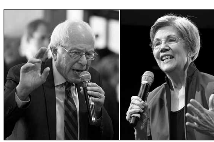
Democratic Party leadership hides behind Bernie Sanders and Elizabeth Warren.

the vital importance of building the widest possible anti-Trump movement centered on the principle of "an injury to one is an injury to all." The debate on strategy and tactics is already in full flow and socialists must energetically engage to stress the need for a bold program with not only defensive demands but also far reaching demands that can mobilize the broader working class like a $15 minimum wage, abolishing college tuition, ending mass incarceration and a massive investment in green infrastruc-