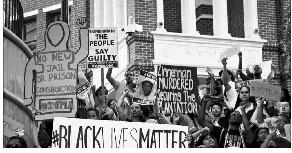
Protesters take to the streets to demand justice for Trayvon Martin as they take over Rodeo Drive on July 17, 2013 in Beverly Hills, California.

segment of workers, youth, and people of color are – not surprisingly – nostalgic for the presidency and legacy of Barack Obama. Without question, his election was a historic moment, but for the mass of workers, youth, and people of color, particularly black workers and youth, little was achieved as his policies primarily benefitted and advanced the agenda of Wall Street for eight years.