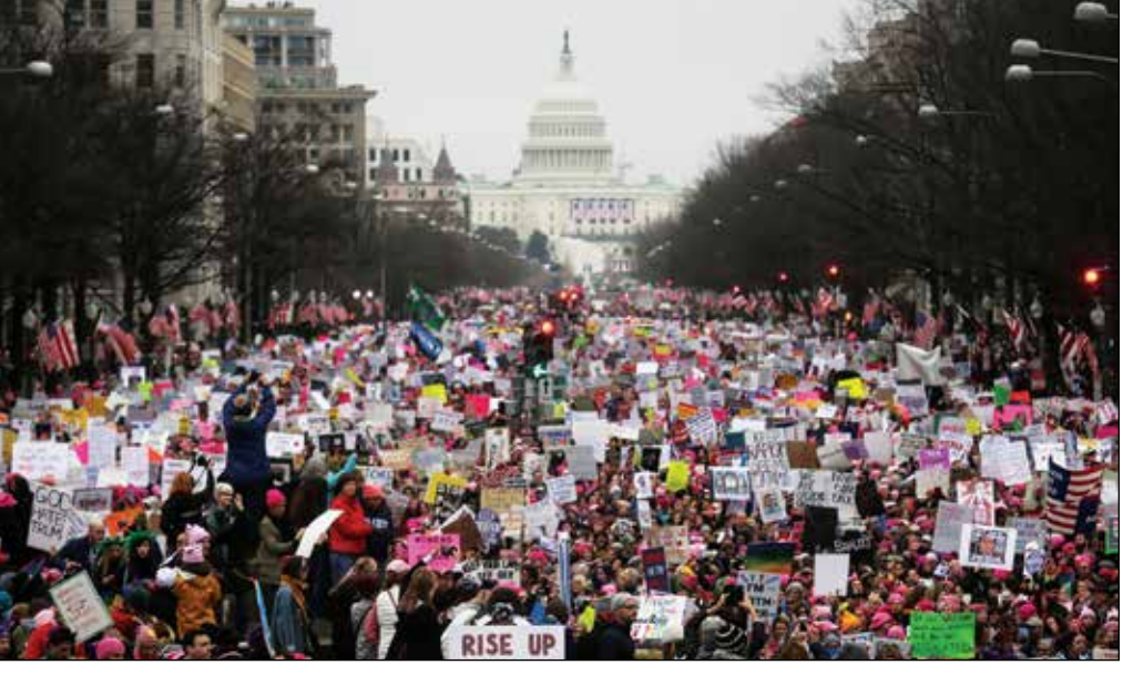
Women's March on Washington protesting Trump's agenda, January 21, 2017.

did not, of course, begin with Donald Trump's inauguration. Literally hundreds of restrictions on abortion rights have been passed by state governments in the past five years, and in many states abortion is increasingly inaccessible.