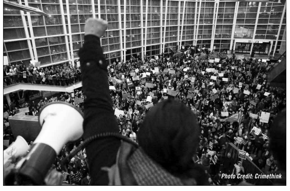
SeaTac airport erupts in protest against Trump's Muslim ban.

But while the pressure from the base is growing, Senate Democrats have had difficulty even maintaining a common front against Trump's odious cabinet appointments with 14 of them voting for every single one of them up until they collectively held the line against Betsy DeVos. Key leaders like Chuck Schumer clearly understand the necessity for a firmer approach and to make some concessions to the