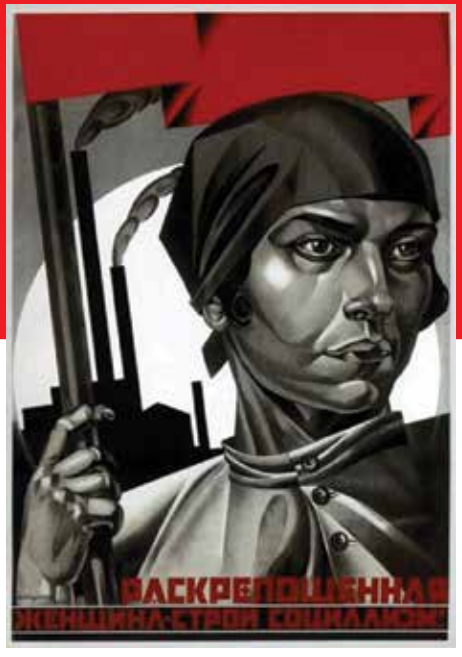
I, liberated woman - build up socialism!, 1926.

This was written in a country where, only a decade before, abortion, divorce, and same-sex