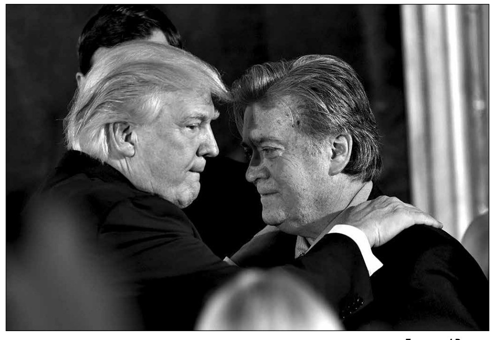
Trump and Bannon.

What is clear is that sections of society, particularly youth and women at this stage,