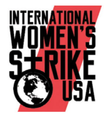
The organizers of the Women's March on Washington are calling for International Women's Day, March 8, to be a "Day Without a Woman."

The attack on women's reproductive rights