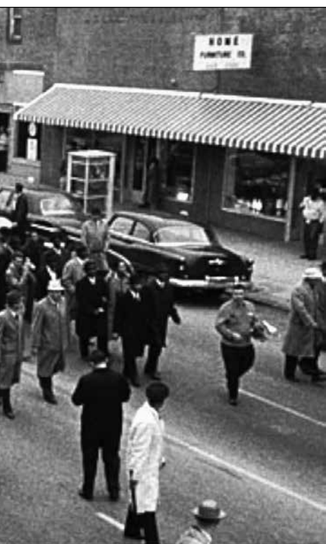
led mass demonstrations and marches, as seen here.

and its membership grew rapidly. White police officers ticketed hundreds of carpool drivers for minor traffic infractions, and arrested blacks on trumped up charges, including King himself, for driving five miles over the speed limit.