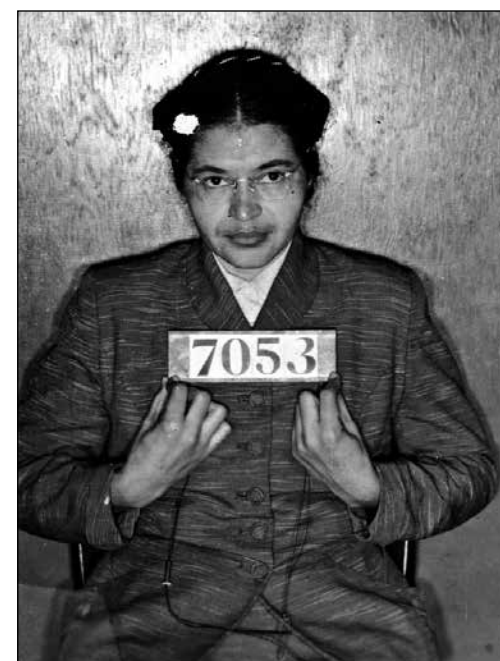
Rosa Parks' 1955 mugshot.

King's poetic words gave voice to the struggles of black people: "We have known humiliation, we have known abusive language, we have been plunged into the abyss of oppression, and we decided to raise up only with the weapon of protest." His strategy of mass, non-violent struggle contrasted with that of the more moderate NAACP leaders who had focused on a legal strategy confined to courtrooms, fearing that mass direct action would alienate