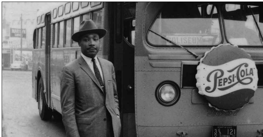
Martin Luther King, Jr. emerged as an important leader during the boycott.