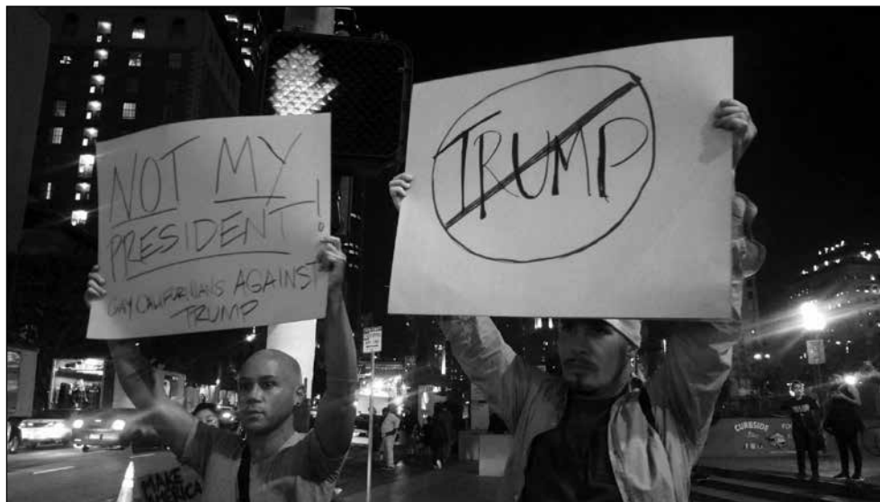
#ResistTrump protest in Los Angeles, November 9, 2016.

It is therefore no surprise that Clinton was unable to enthrone greater voter turnout. Neither Trump nor Clinton got 50% of the vote. And while Clinton got a very slightly larger share of the popular vote than Trump, she got six million fewer votes than Obama in 2012