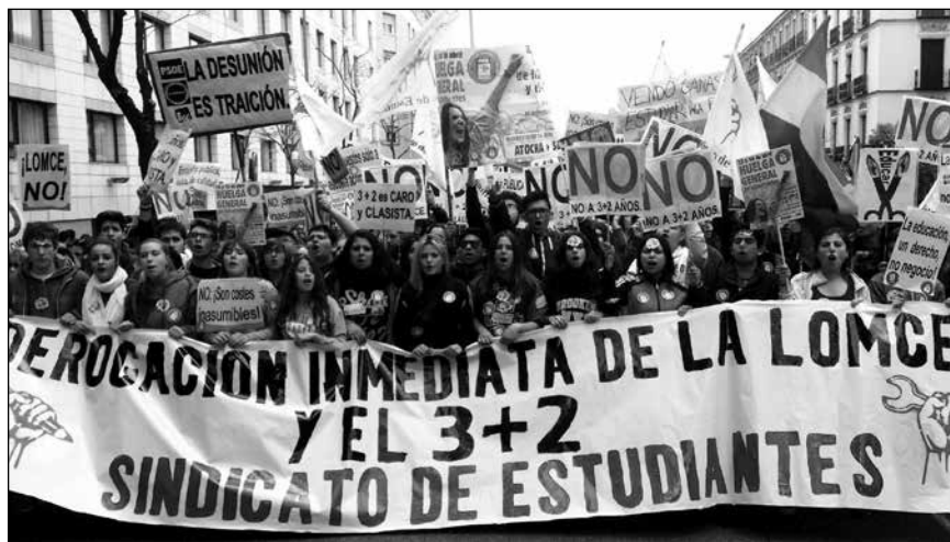
Spanish students on strike in October, 2016.

The strike targeted the Organic Law for Improving Education Quality, or LOMCE in Spanish, which will increase tuition by up to 66% and cut resources for scholarships by 50 million euros. Both policies will clearly hurt poor and working-class students disproportionately. A key demand of the strike was to abolish “revalidation exams” – standardized tests that must be passed to move to the next grade. They also want to abolish similar elementary and middle school tests. These exams were