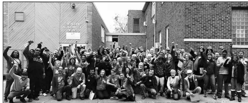
15 Now gathered over 100 people in Minneapolis at its October 15 meeting.

Socialist Alternative and 15 Now Minnesota have been fighting for a $15 an hour minimum wage in Minneapolis for over two years. Over that time, $15 an hour went from a far-out proposal from cities like Seattle to being supported by 68% of Minneapolis residents. Through grassroots organizing, strikes, and demonstrations, low-wage workers – not Democratic Party politicians – have decisively won the battle of public opinion. Even though the national Democratic Party theoretically supports $15 an hour in their platform, Minneapolis Democratic Party politicians have been a principal obstacle to winning. It shows the deep ties the Democrats have with big business, even at a local level, and points to the need to build an independent political challenge to their rule.