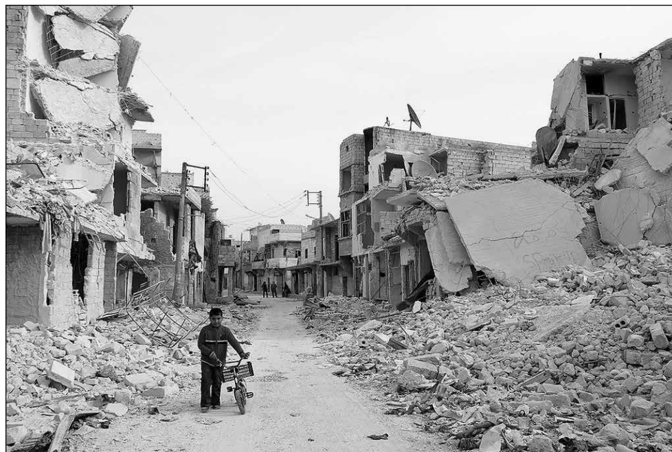
An Aleppo neighborhood destroyed by war.

occupation used brutal divide and rule tactics between Shiites, Sunni and Kurdish people, unleashing unending sectarian conflict and a disastrous failed state.