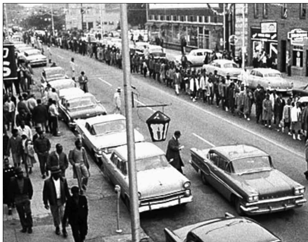
The boycott included

Socialists played a key role in building the CIO unions and understood the necessity of uniting workers regardless of race, ethnicity or gender. Labor leaders knew that organizing the South was vital to the further development of a united and powerful national labor movement. However, the refusal of the CIO union leaders to challenge Jim Crow and McCarthyism during its “Operation Dixie” organizing drive in the 1940s tragically left the Southern working class deeply divided – a key setback for the whole labor movement.