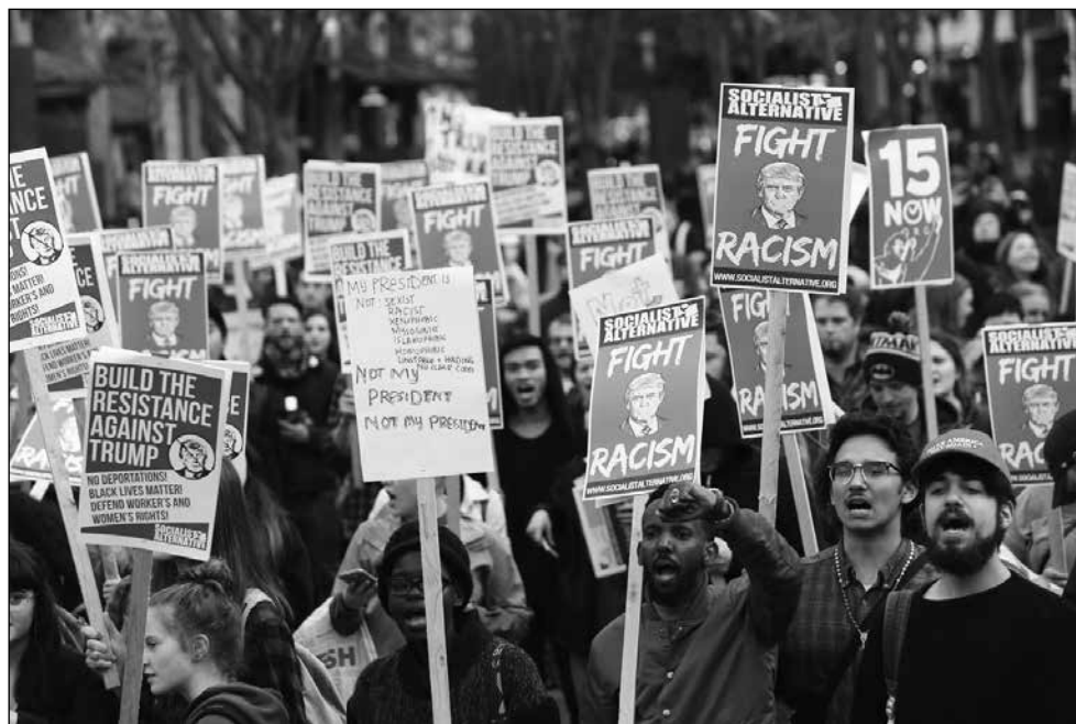
Seattle #ResistTrump protest the day after the election.

We immediately called protests in cities around the country to make it clear that working people and the oppressed must stand together and prepare to resist the attacks of the right. In the past 24 hours we have been inundated with requests for more information about our organization. We must start today