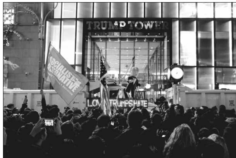
Protest at the Trump Tower in Manhattan.