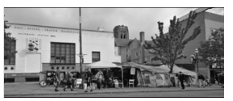
A homeless encampment in Seattle's University District.

Last November, the mayor of Seattle formally declared a state of emergency over homelessness. Yet, that same month, he and seven Democratic members of the City Council–all but Socialist Alternative member Kshama Sawant and one other councilmember – shot down a proposal to support the bare-bones $10