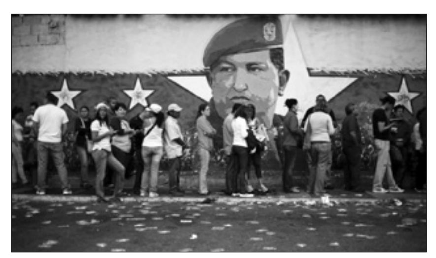
Venezuelans wait in line to vote beneath a murla of deceased president Hugo Chavez.

These features accelerated recently due to the collapse in the price of oil – down from $120 a barrel at the time of the global financial crash in 2008 to approximately $30, and still falling. Inflation has been running in triple digits, the highest in the world.