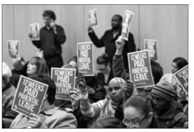
People pack a Seattle City Council meeting in support of parental leave.

even conservative news outlets like Bloomberg and Forbes declare that paid parental leave is a logical, efficient way to approach a predictable life event for working people, why do politicians keep telling us the time isn't right?