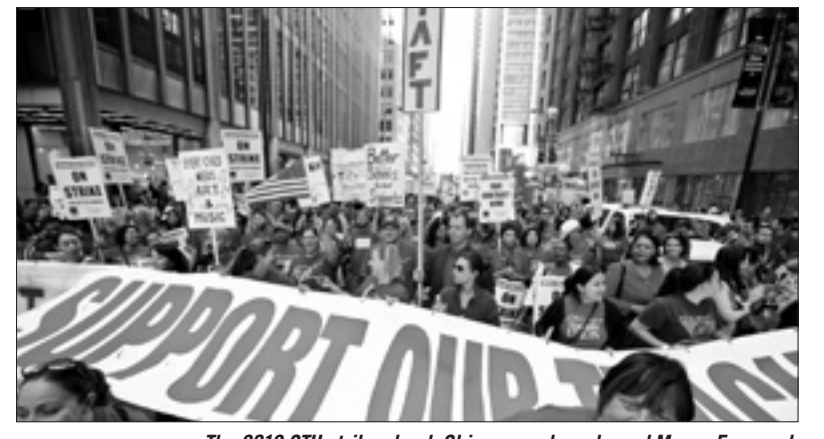
The 2012 CTU strike shook Chicago and weakened Mayor Emanuel.

On February 4, the union called a mass rally in Chicago's financial district. Five thousand teachers and supporters filled downtown streets. They protested not only Rahm Emanuel's policies, but also Illinois Governor Bruce Rauner's recent announcement that he is considering declaring the Chicago schools as "failing," which would