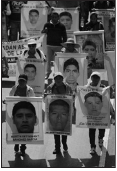
Families of murdered students march in Mexico City.

Mexican people need to form their own independent unions and break from the corrupt political parties to begin to form a mass workers party fighting for their everyday needs, including the right to defend themselves against the brutal drug cartels and government repression. The striking teachers and the movement for the 43 can be the tipping point that pushes the working class of Mexico, after years of setbacks and defeats, to mount an effective mass resistance against the austerity and repression dealt by their government.