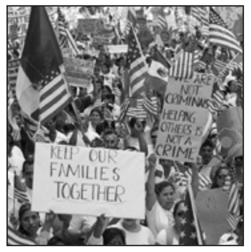
Immigration rally in 2006.

Donald Trump's racist call for the mass deportation of 11.2 million undocumented immigrants is stirring up popular outrage among immigrants and progressive workers. More outrageous than Trump's racist rhetoric is the lack of response from the Republican establishment. Even top Democrats