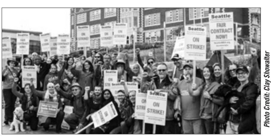
Teachers' picket line at Garfield High School on September 13, 2015.

Drawing lessons from the 2012 Chicago Teachers Union strike, the SEA was able to mobilize parents and community members who have seen Washington State become an active battleground in the fight for public education. The active participation of members was outstanding. Between 95 and 97% were on the picket lines. Thousands came to the