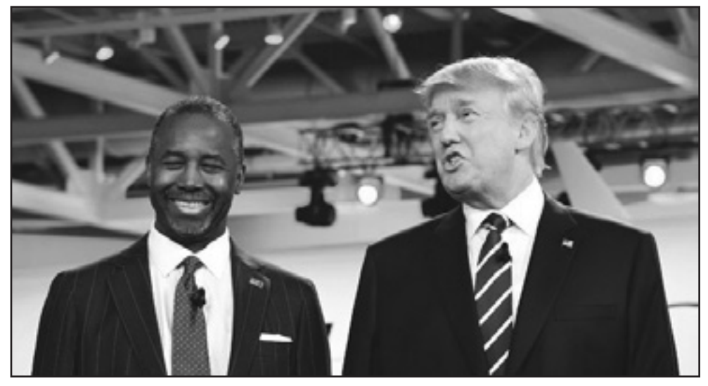
Ben Carson and Donald Trump.

Guaranteed quality health care and a jobs program paid for by taxes on the super-rich, for instance, are popular policies among