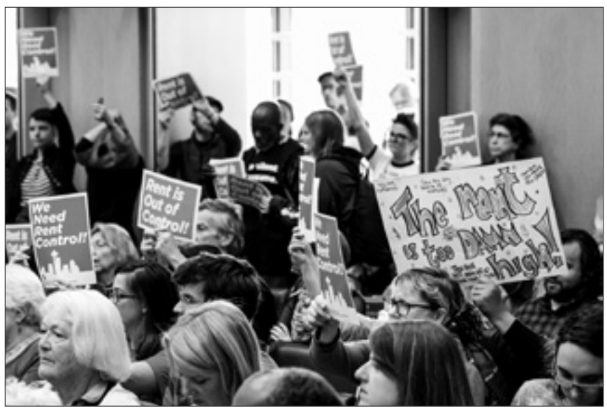
Already we've achieved our first victory: On September 21, 2015, the Seattle City Council, under tremendous pressure from our movement, was forced to formally ask state lawmakers to lift the statewide ban on rent regulation.

KS: Developer lobbyists often argue that the price of housing is simply a function of supply and demand. Left to their own devices, though, developers generally maximize their profits by building luxury apartments and condos. And rather than lowering rents, such development, instead, tends to drive up prices in a given neighborhood, as existing affordable housing is torn down and replaced with high-end units.