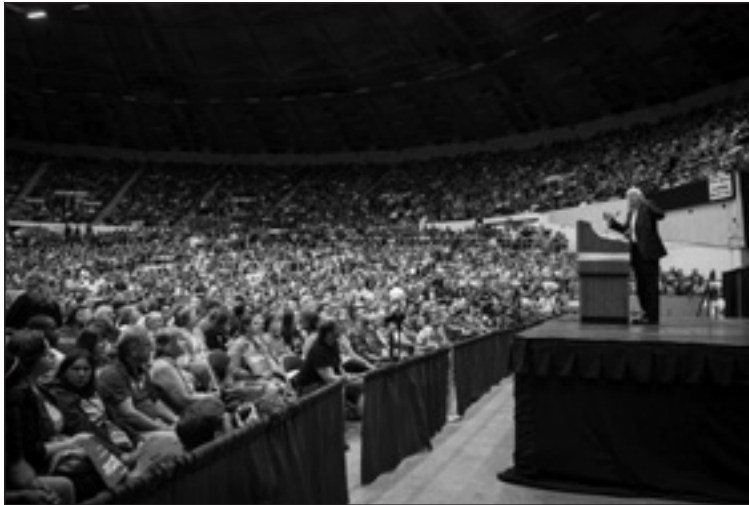
Bernie Sanders speaks to 20,000 at a campaign stop in Wisconsin, May 30, 2015.

This positive proposal for the boldest possible challenge to Clinton and Bush or Walker, alongside boldly building the socialist movement and connecting the campaign