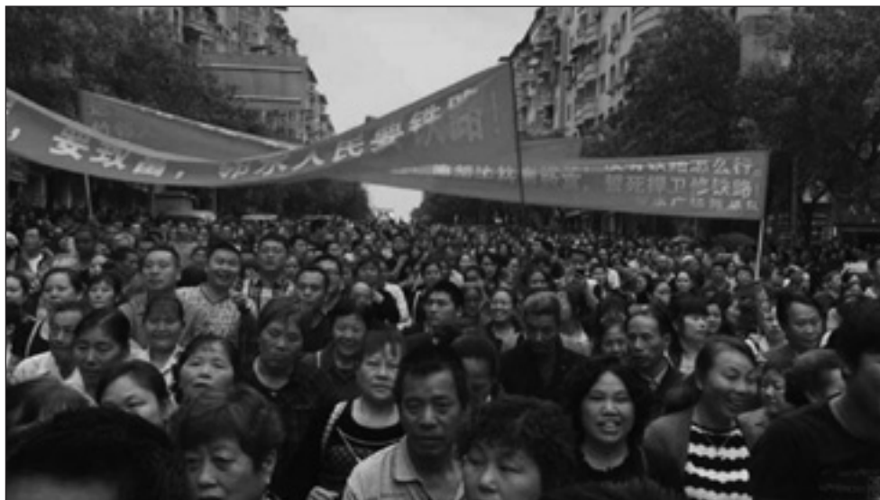
Protests in Linshui erupted into violence in May, 2015.

There are at least three major signs of a deepening crisis in China that could ultimately spell the end of the one-party dictatorship. Top of the list is the worst economic performance for three decades, which has led many global commentators to point to a Chinese “hard landing” as the main threat to