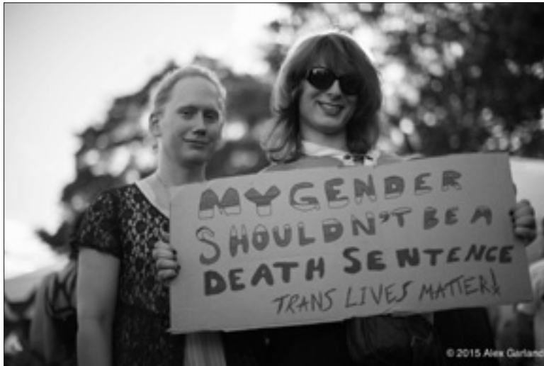
On June 26, 4,000 people took to the street for Trans* Pride Seattle.

From the transgender women and gay men who fought back against racist police during the Compton Cafeteria Riots in 1966, to the militant ACT-UP organizers who demanded the FDA approve life-saving AIDS medication in the early 1980s, the material gains of LGBTQ people have consistently been won in the streets long before they are won in the courts. Marriage equality is a huge victory for all LGBTQ people, but it is only one step on the road to true equality, as the developing transgender liberation movement shows.