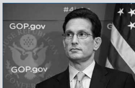
Republican House Majority Leader Eric Cantor lost in the GOP primary. His opponent painted him as an advocate of crony capitalism.

The swift takedown of business-backed Cantor revealed the alienation of ordinary people from the political establishment. Brat even used a certain rhetoric against "crony capitalism" to attack the former House majority leader. However, he linked his attacks to anti-immigrant propaganda and his populist Tea Party-style agenda.