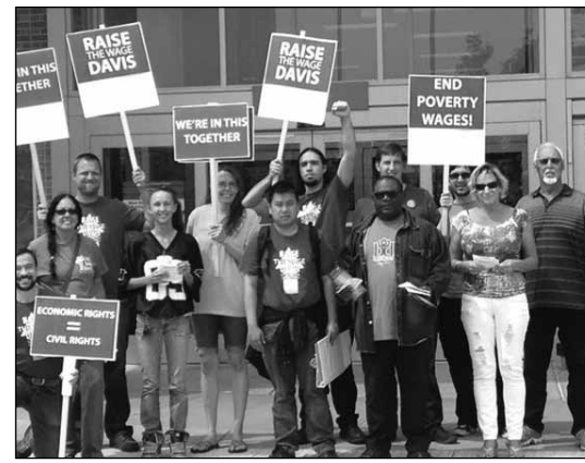
15 Now demonstrations from around the country. Clockwise from upper left: Portland, OR; Mobile, AL; Philadelphia, PA; and Davis, CA.

This would be a step forward, but only small one. Neither of those figures represents a living wage. In a city like Boston, $15 is just the starting point for livable, and that's cutting it close. Working people signing our petitions have mentioned this key point to us again and again: They agree with other minimum wage initiatives because any increase is good, but those initiatives don't even come close to a living wage. That's why low-wage workers all over the country are demanding $15.