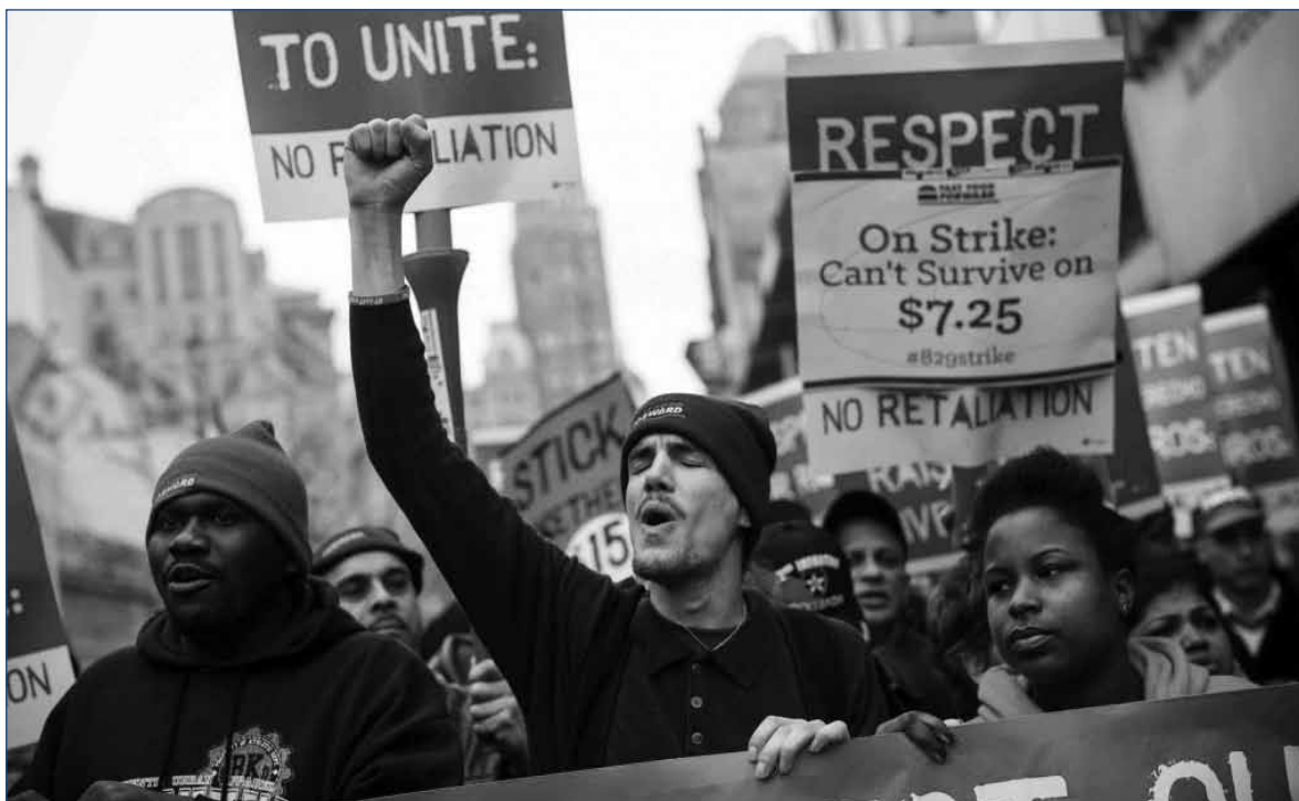
Fast-food workers in New York on strike.

After the victory in Seattle, the movement for a $15 an hour minimum wage is taking off. A section of the union leaders, in cooperation with left Democrats, are making