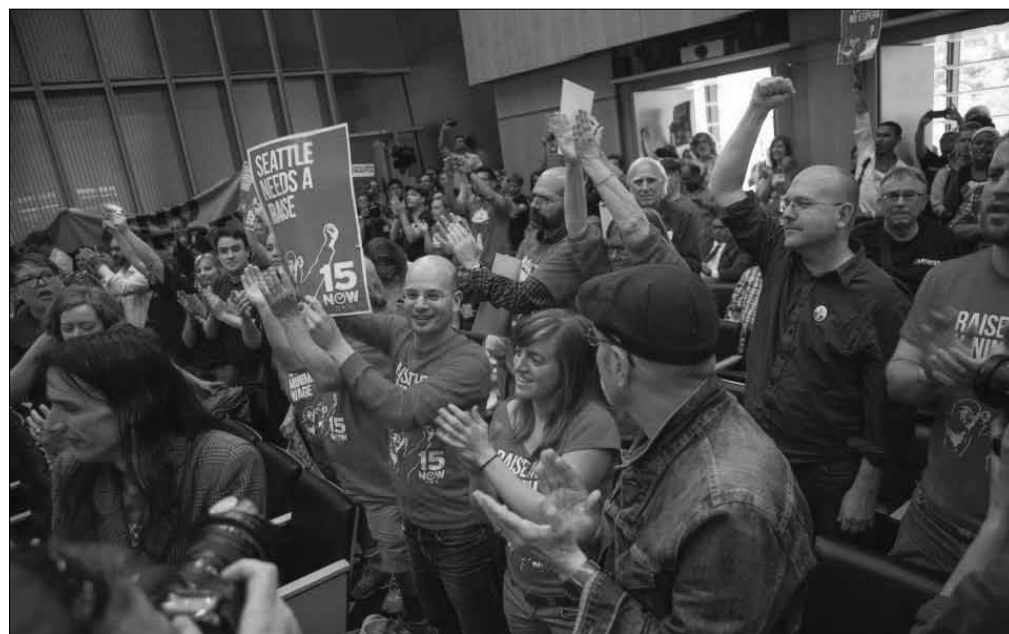
A packed Seattle City Council Chambers celebrates the passage of a $15 an hour minimum wage, 6/2/2014.

Unfortunately, the strategy of those leading the main labor unions was not focused on building the movement from below; instead, it