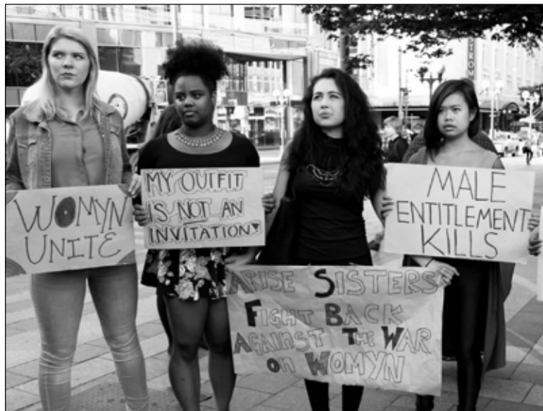
#YesAllWomen demonstration in Seattle.

In capitalist society, we are also endlessly bombarded by corporate advertisements that prey on our insecurities to get us to buy products