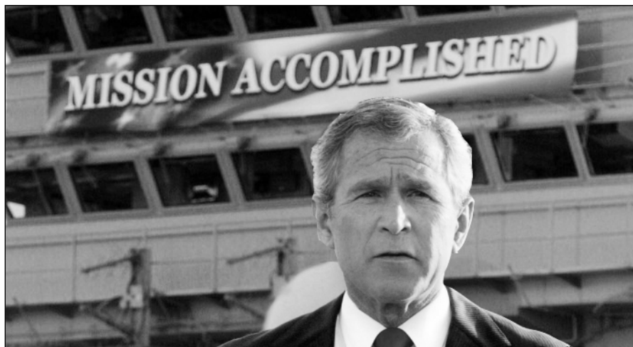
Iraq is now spiraling into sectarian conflict over ten years after George W. Bush claimed victory.

Former Ba'athist security personnel from Saddam Hussein's ousted regime were among those who joined the offensive. Meanwhile,