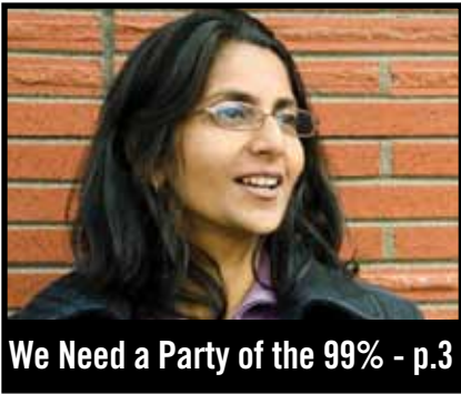
We Need a Party of the 99% - p.3