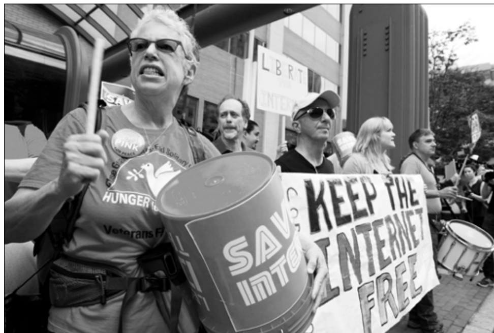
Activists protest outside the FCC during the vote to end net neutrality.

Companies like AT&T, Verizon, and Comcast specialize in the physical network of cables that make the Internet work. Requiring that network to be neutral is a direct threat to their profitability. Companies like