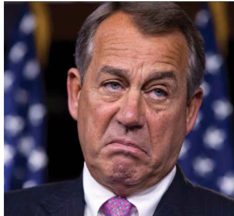
Republican politician John Boehner said he would rather commit suicide than increase the minimum wage