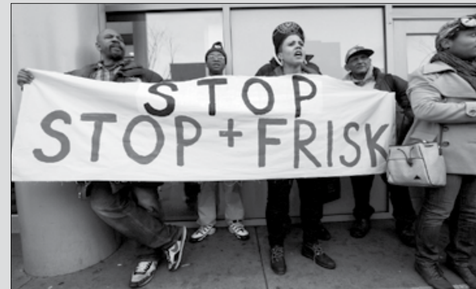
De Blasio promised to end the racist "Stop and Frisk" policy

Since being elected, de Blasio has indeed set out to enact a series of progressive measures, albeit with serious limitations. For example, he rapidly announced the significant scaling back of the hated "Stop and Frisk" policy of the New York Police Department. This was a real step forward, although not quite the "end the era of stop-and-frisk policing" promised during his election campaign. In March, de Blasio also signed a bill that extends the right to paid sick leave to a further 500,000