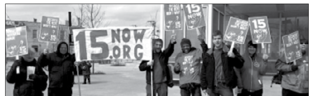
15 Now rally in Chicago

During the week, Seattle's Action Groups performed banner drops, phone banked, leafleted at super markets, and as a result were able to mobilize 750 people to Seattle's March for $15th on March 15th. The