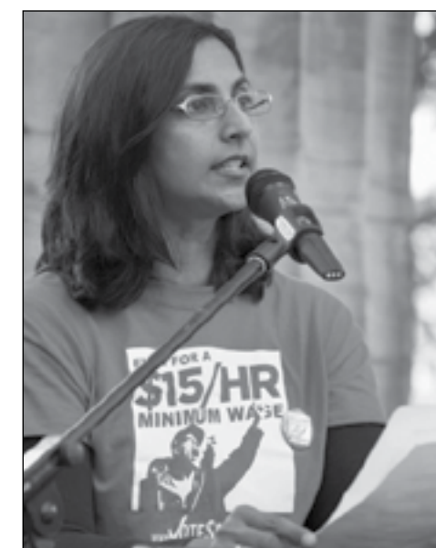
By Kshama Sawant, Seattle City Council Member and member of Socialist Alternative

As a socialist, I believe that democratic rights cannot develop or exist under a state of perpetual surveillance. For more than a decade now, the Department of Homeland Security has been actively expanding surveillance and domestic spying capabilities. At the same time, it has financed the brazen militarization of local police forces