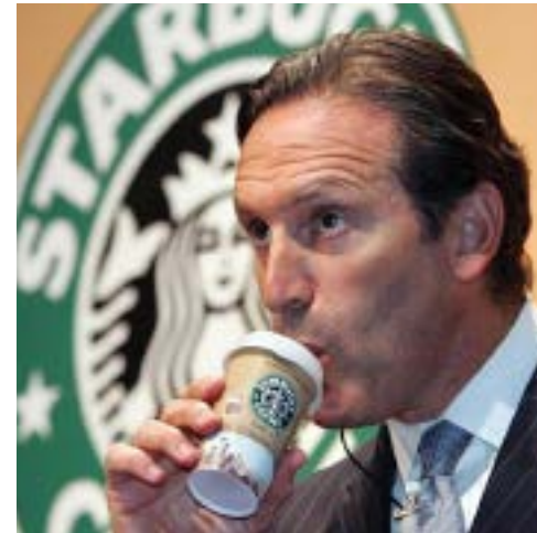
Starbucks CEO Howard Shultz spoke out against the fight for 15

The argument that raising the minimum wage would lead to widespread layoffs is always at the heart of the big business campaigns against raising the