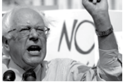
Senator Bernie Sanders from Vermont helps working people organize

While Bernie Sanders clearly stands out as a genuine progressive and a champion of ordinary people, Socialist Alternative does not agree with him on all issues. For example, he argues that the model for socialist policies is the Nordic countries, Denmark, Finland, Sweden and Norway. The reality is that while these societies had highly evolved welfare states, the social gains made by working