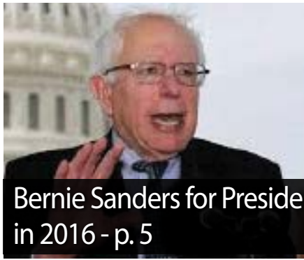
Bernie Sanders for President in 2016 - p. 5