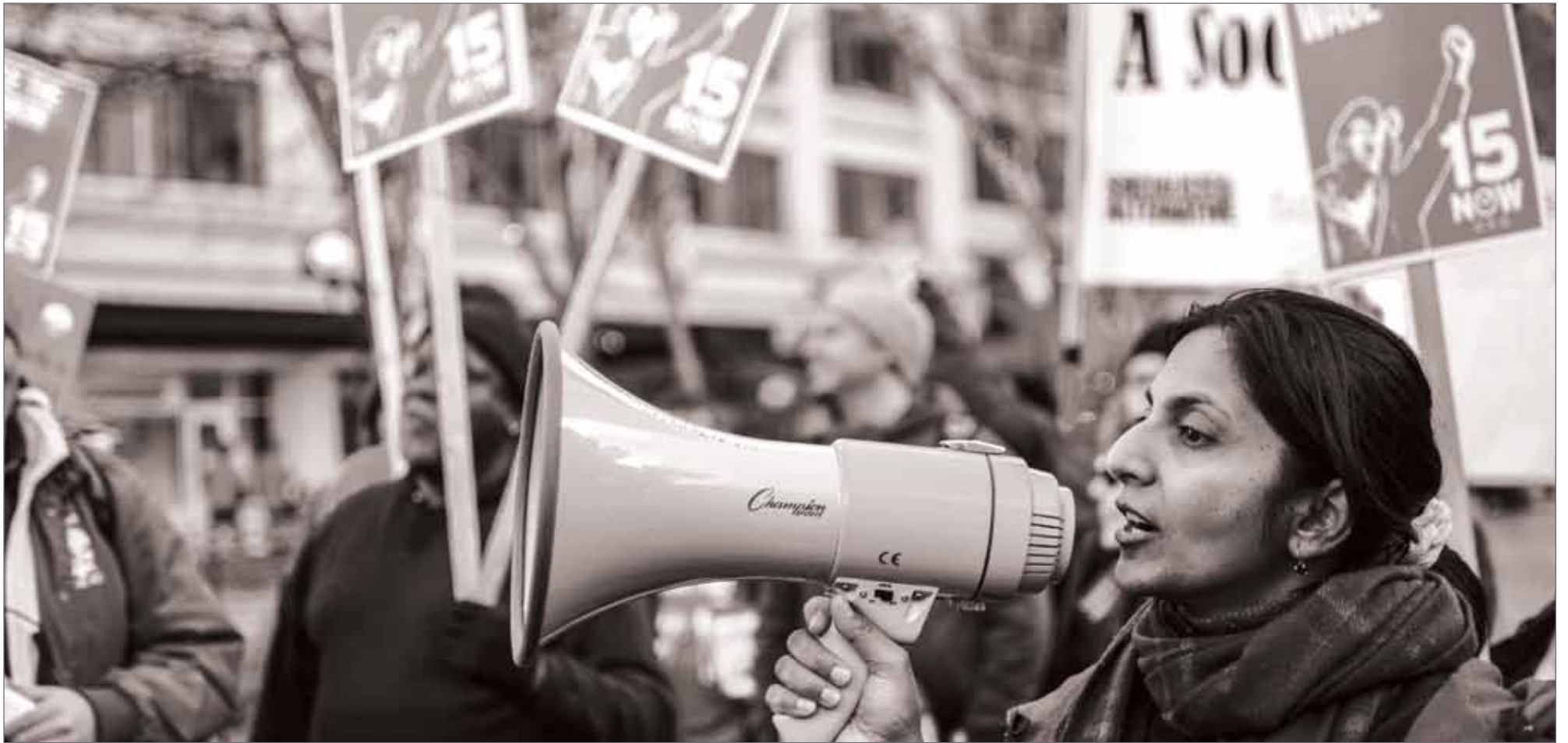
Kshama Sawant speaks at an MLK rally on January 20

Last year, fast food workers across the country organized waves of one-day strikes demanding a $15/hour minimum wage and the right to organize a union without retaliation. This exciting movement has taken root most firmly in Seattle: Kshama Sawant, Socialist Alternative city councilor, is forcing the entire political establishment to take a stance on the issue. Voters in SeaTac, a small city just south of Seattle, narrowly approved a labor-backed ballot initiative on $15 in November despite big business pouring millions of dollars into the town of just 28,000 people in an attempt to defeat the initiative.